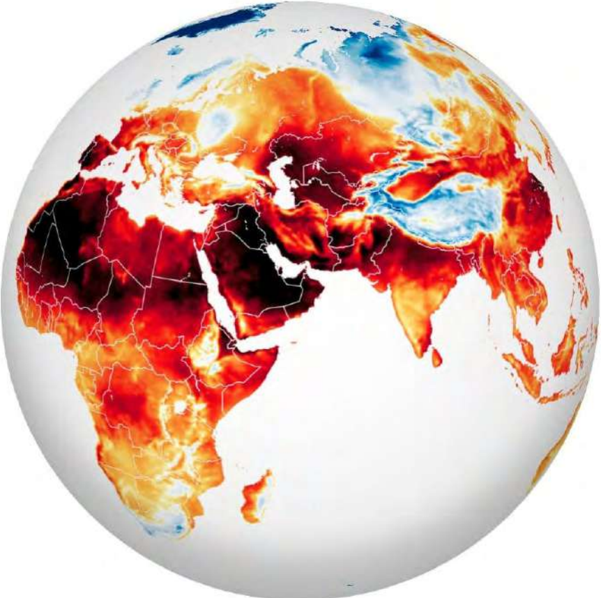
NASA recently released a map depicting the warm regions of the world in red and cool regions in blue. In the map, one can see the surface air temperatures across most of the Eastern Hemisphere on July 13, 2022.

Robert Stefanski, chief of Applied Climate Services at the