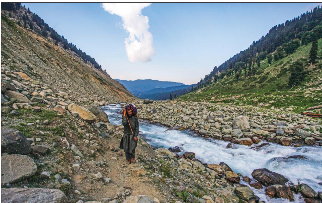
A nomad passes through a stream to reach his hutment in the picturesque Kousarnag Lake in South Kashmir's Shopian district.

He said that setting up a women's police More on P6