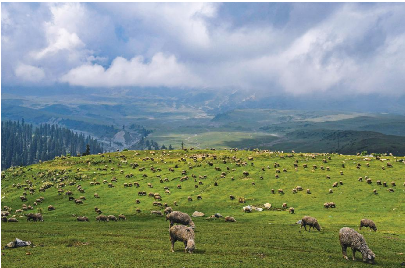
A huge flock of sheep left for grazing by shepherds in the vast Tosa Maidan meadow in central Kashmir's Budgam district on Wednesday.

The Election Commission had on Monday posted photographs of the sealed ballot boxes on-board flights More on P6