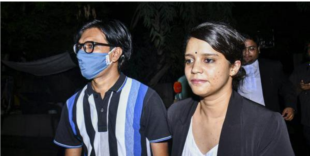
Tihar Jail at around 9 pm.

Zubair, dressed in striped T-shirt and blue trousers, showed the victory sign as he hurriedly left in a car after his release from