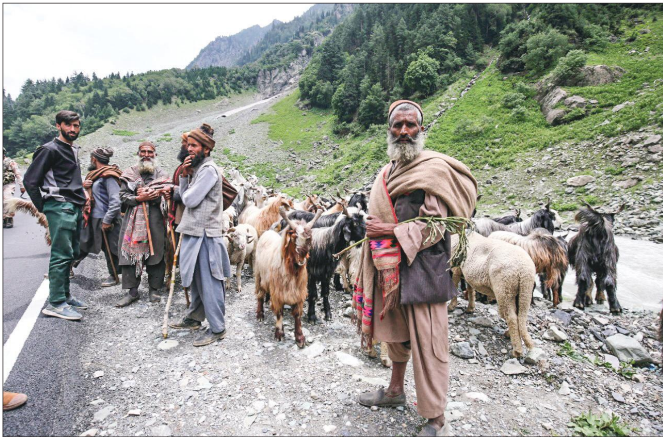
Nomads, popularly known as Bakerwals, leading their flock of sheep and goats, towards the greener pastures of Sonmarg in central Kashmir's Ganderbal district on Wednesday.

Sources said that the intelligence agencies in J&K have asked security More on P6