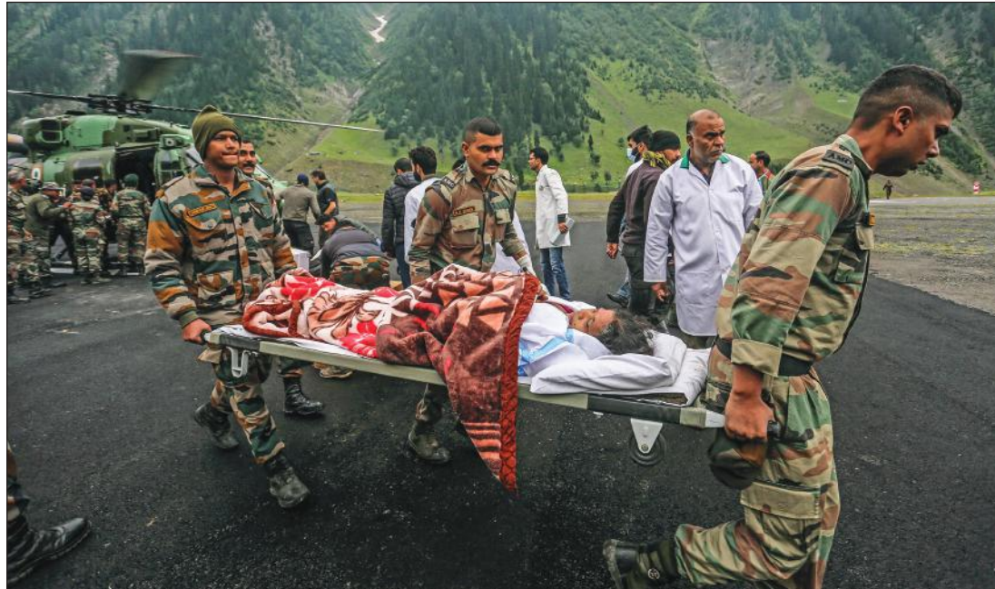
An injured woman airlifted from Amarnath cave shrine to the Baltal Base camp being shifted by rescue workers to a hospital for treatment.

"In carrying out rescue and relief operations in such difficult terrain, rescuers always face hostility in operation," the official who didn't