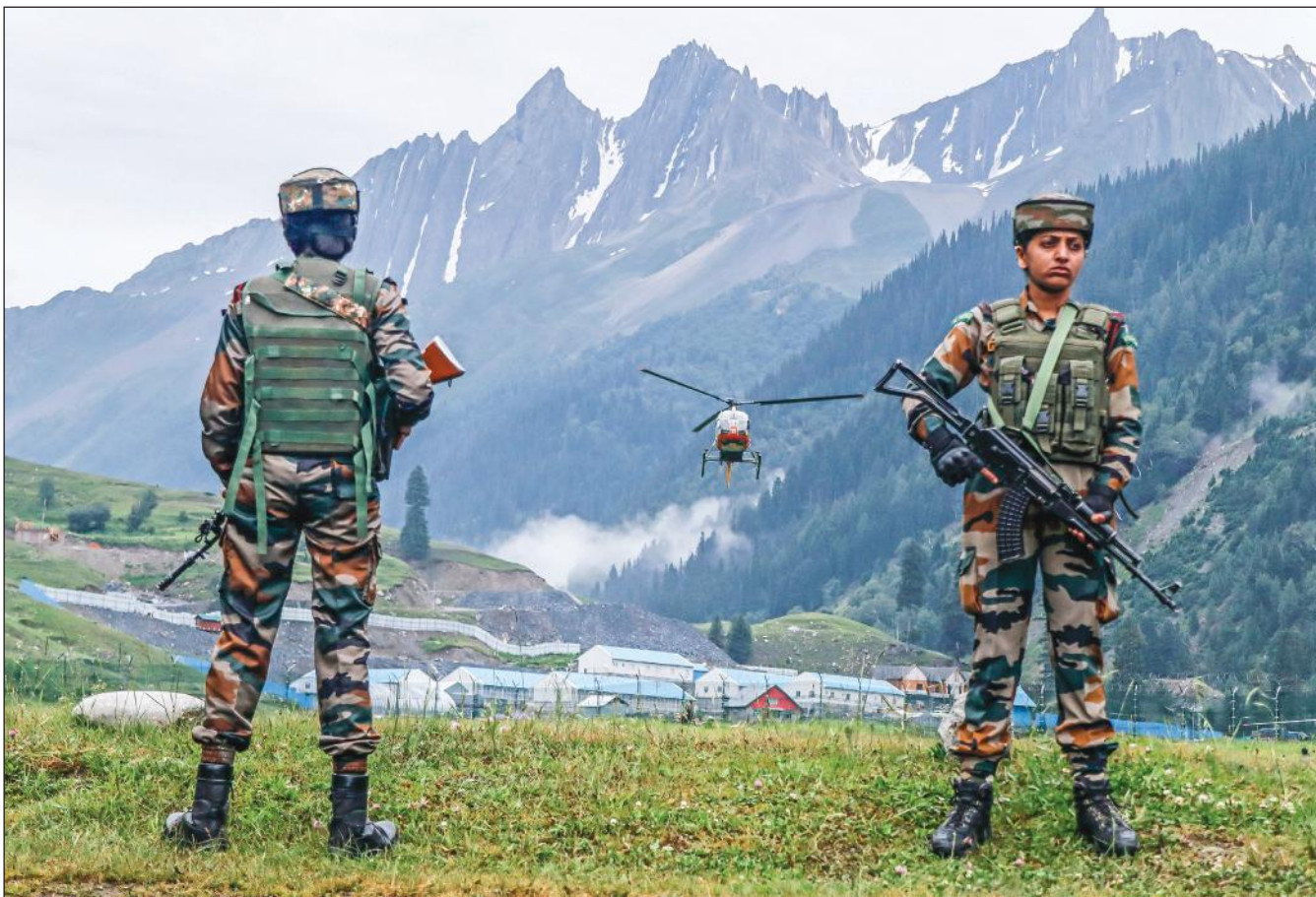
A military chopper carrying injured people approaches the highly fortified Baltal Base camp in Ganderbal district on Saturday.

"However, from Srinagar, I urge her to make same affirmations and promises I have made. The people of Jammu and Kashmir also expect this assurance from her," he added. The opposition More on P6