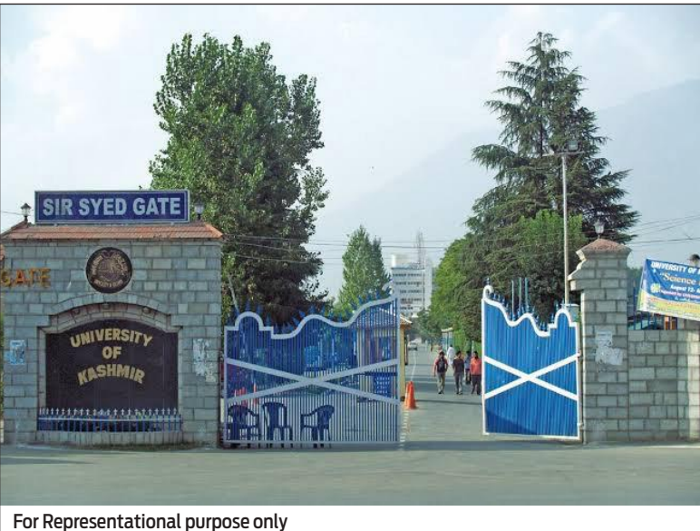
For Representational purpose only

Philosophy has earned the reputation of being too abstruse, far removed from masses and unconcerned towards the lives of people in its mundane and pragmatic dimensions. This understanding is misconstrued and rests upon the distorted image of the subject. Philosophy is in fact the repository and treasure-trove of theoretical frameworks which underlie and define our engagement with our culture, fellow humans and our own selves. This understanding reclaims the department of philosophy as a space of cultural preservation and reconstruction bringing it closer to the pragmatic and practical dimensions of human life. In a paradigm like this, the absence of the Department of Philosophy at the highest seat of learning reflects the indifference and heedlessness we as a nation tend to have towards our culture, the legacy of tradition and our lackadaisical