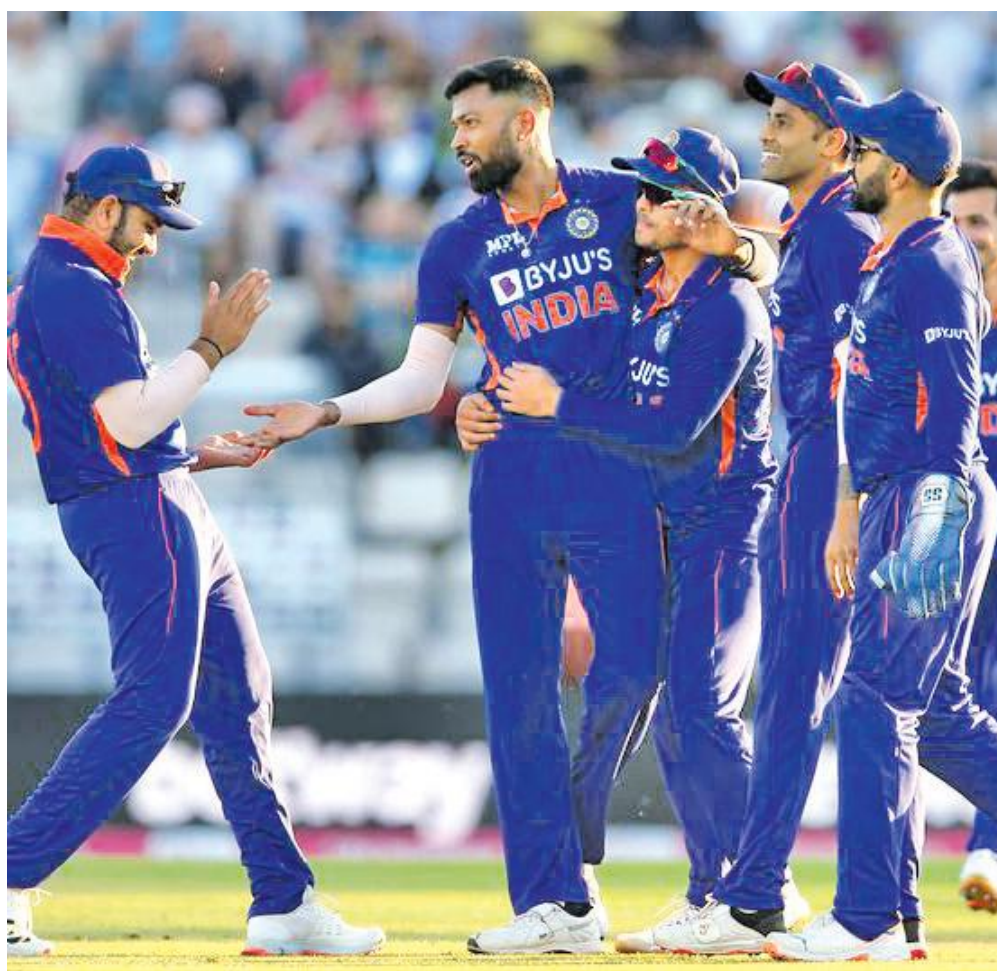
TEAM INDIA CELEBRATES AS they romped to a 50-run victory over England in the first T20I at Edgbaston on Thursday.

CA acknowledged the role played by the Sourav Ganguly-led BCCI in successfully completing the tour amid the COVID-19 pandemic.