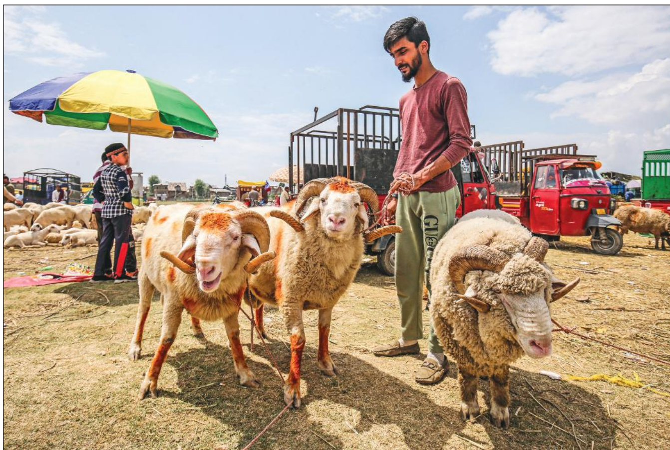
A man displays four-horned sheep at a makeshift market established inside Srinagar's Eidgah, days ahead of Eid-ul-Azha.