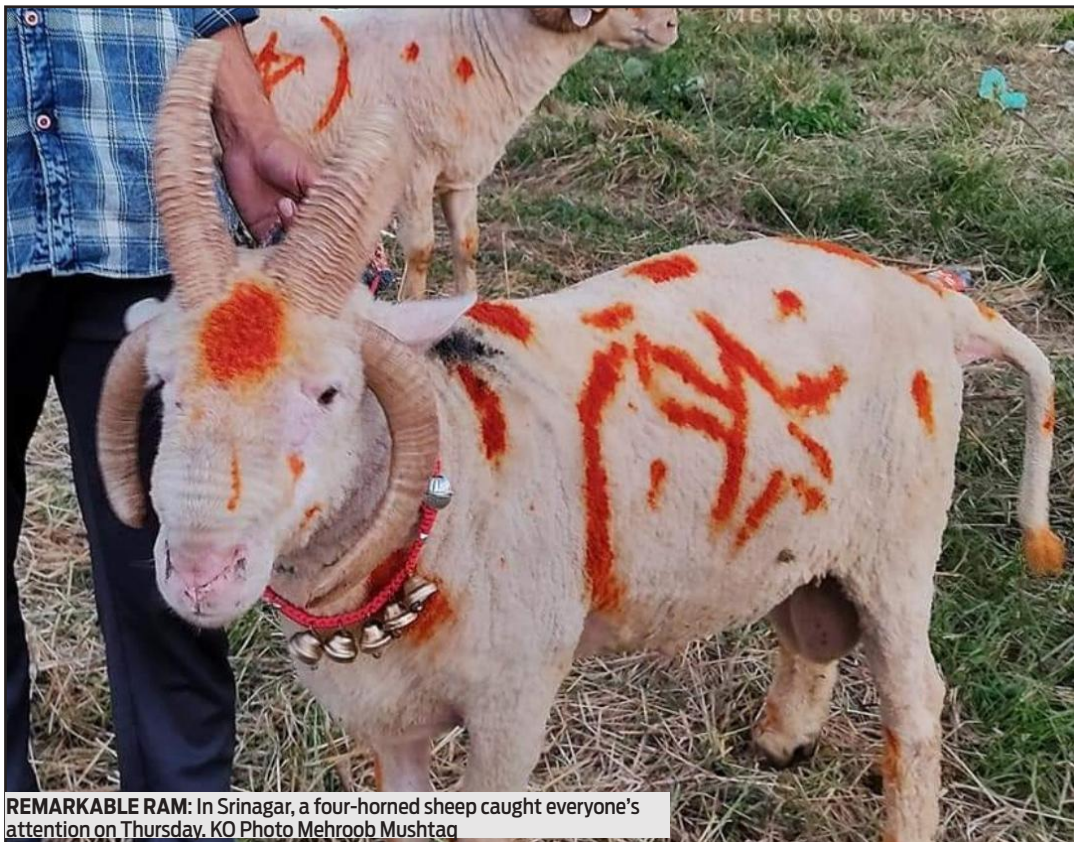
REMARKABLE RAM: In Srinagar, a four-horned sheep caught everyone's attention on Thursday.

present status of activities undertaken for development of Shahr-e-Khaas including opening of Sunday Market in Eidgah area, installation and repairing of Street lights, construction of public convenience at prominent places in Shahr-e-Khaas, construction of 2nd story of SDA shopping complex, allocation of space for car parking in important areas in Shahr-e-Khaas, op-