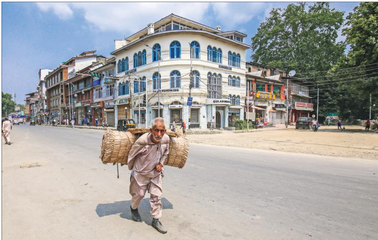
It's not about perfect. It's about effort: A man on a lookout for buyers for his Wagu Mat now very rarely used in the households.

"There's already lots of water in local streams, rivers etc. due to melting of glaciers etc. Addition of rain water in these streams often generate flash flood, mudslide etc," the officials said, adding, "People More on P6