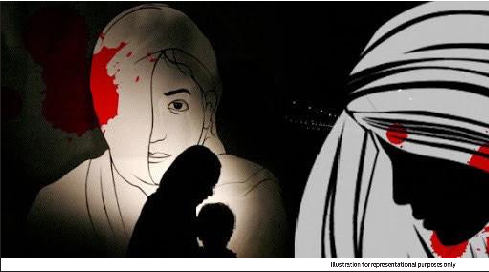
Illustration for representational purposes only

Kashmir is considered, especially by Kashmir's self image as one of the safest places, when it comes to the crime rate especially against women. Yet, our newspapers are often filled with reports of violence against women in intimate partner relationships.