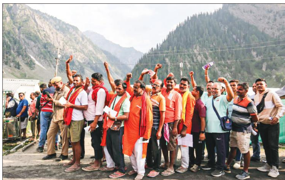
A group of Amarnath yatis chant slogans on their arrival at the Baltal Base camp in Central Kashmir's Ganderbal district on Wednesday.

National Conference president Farooq Abdullah, J-K BJP chief Ravinder Raina and