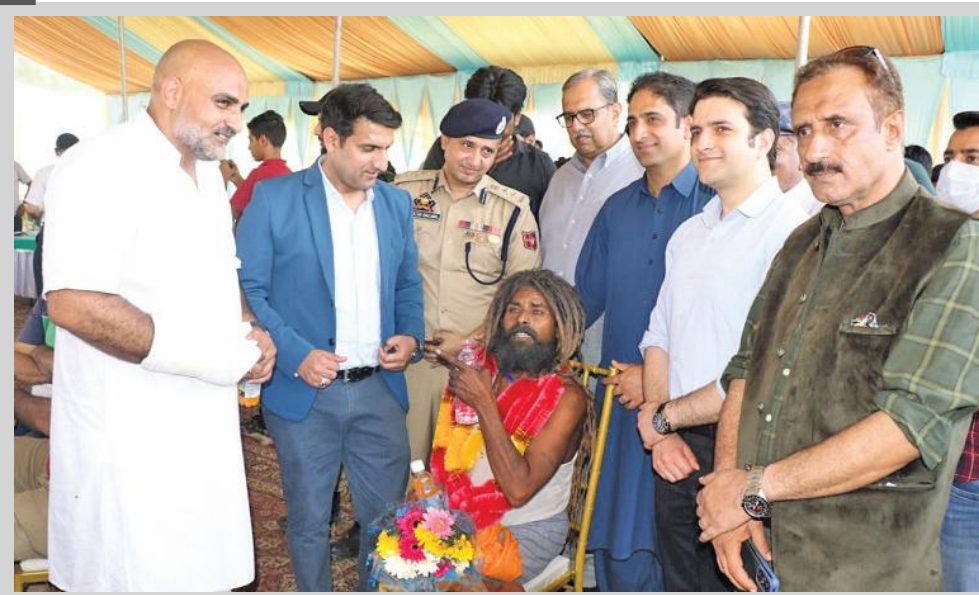
SENIOR CIVIL ADMINISTRATION AND POLICE OFFICIALS welcoming a Sadhu on his arrival at the Yatra Transit Camp Panthachowk here on Wednesday