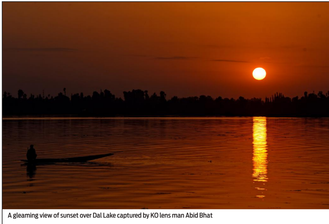
A gleaming view of sunset over Dal Lake

He said that thieves have unsuccessfully tried to break the locks of other shops as well.