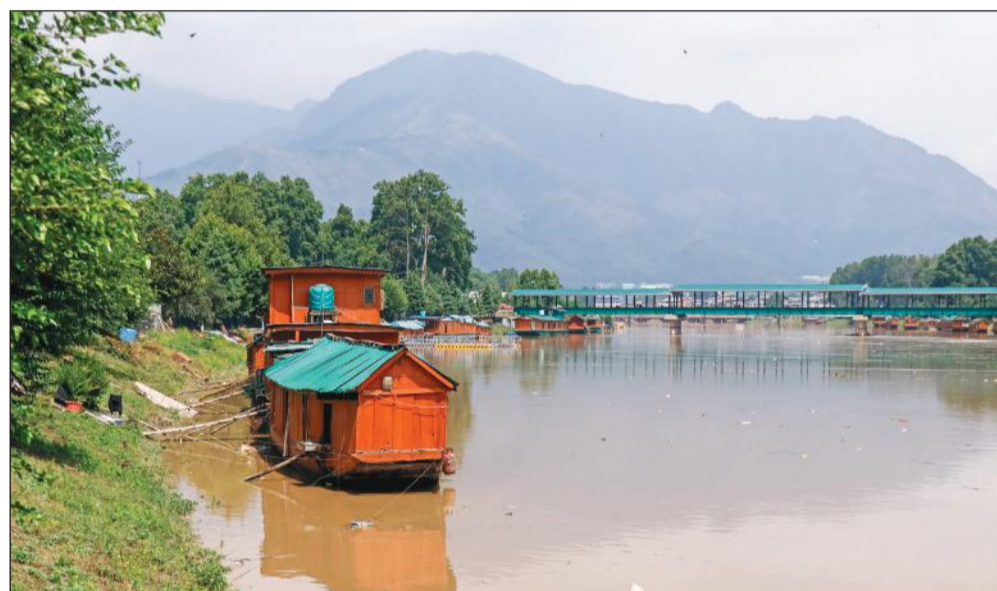
KO File Photo