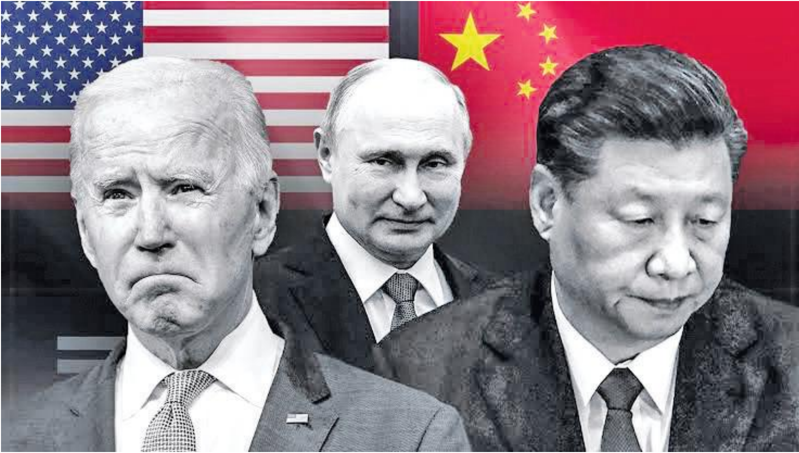
US President Joe Biden declared last month that his country would get involved militarily should China attack Taiwan

US President Joe Biden declared last month that his country would get involved militarily should China