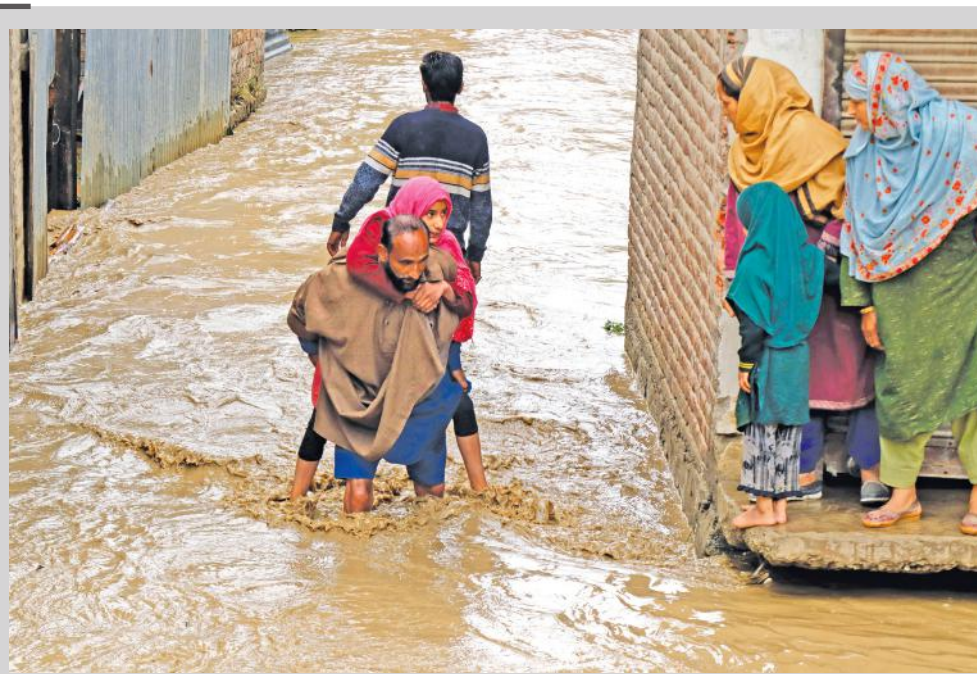
A MAN CARRIES HIS DAUGHTER through knee deep waters in the flood-hit Bemina area of the city on Wednesday.

It was also informed that the directorate will deploy good number of health care workers for Yatra duties in order to provide the best medical services to the devotees at make-shift hospitals.