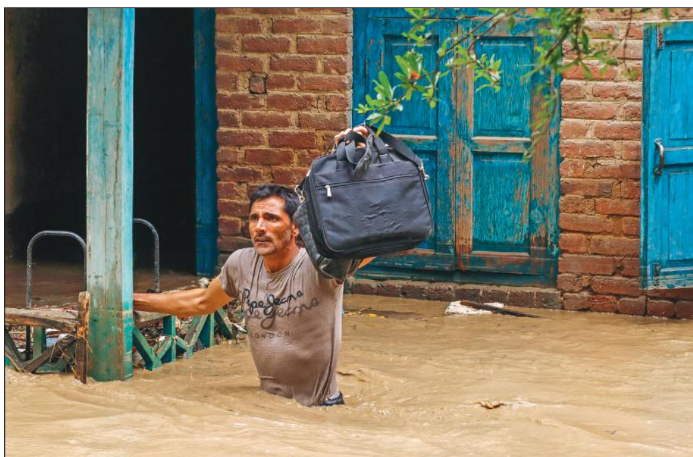
A man carrying his belongings from his submerged house in Bemina area of the city on Wednesday

Pertinently, authorities have also sounded a flood alarm in Srinagar after the water level in Jhelum breached 16-ft mark at Ram Munshibagh here. As per officials More on P6