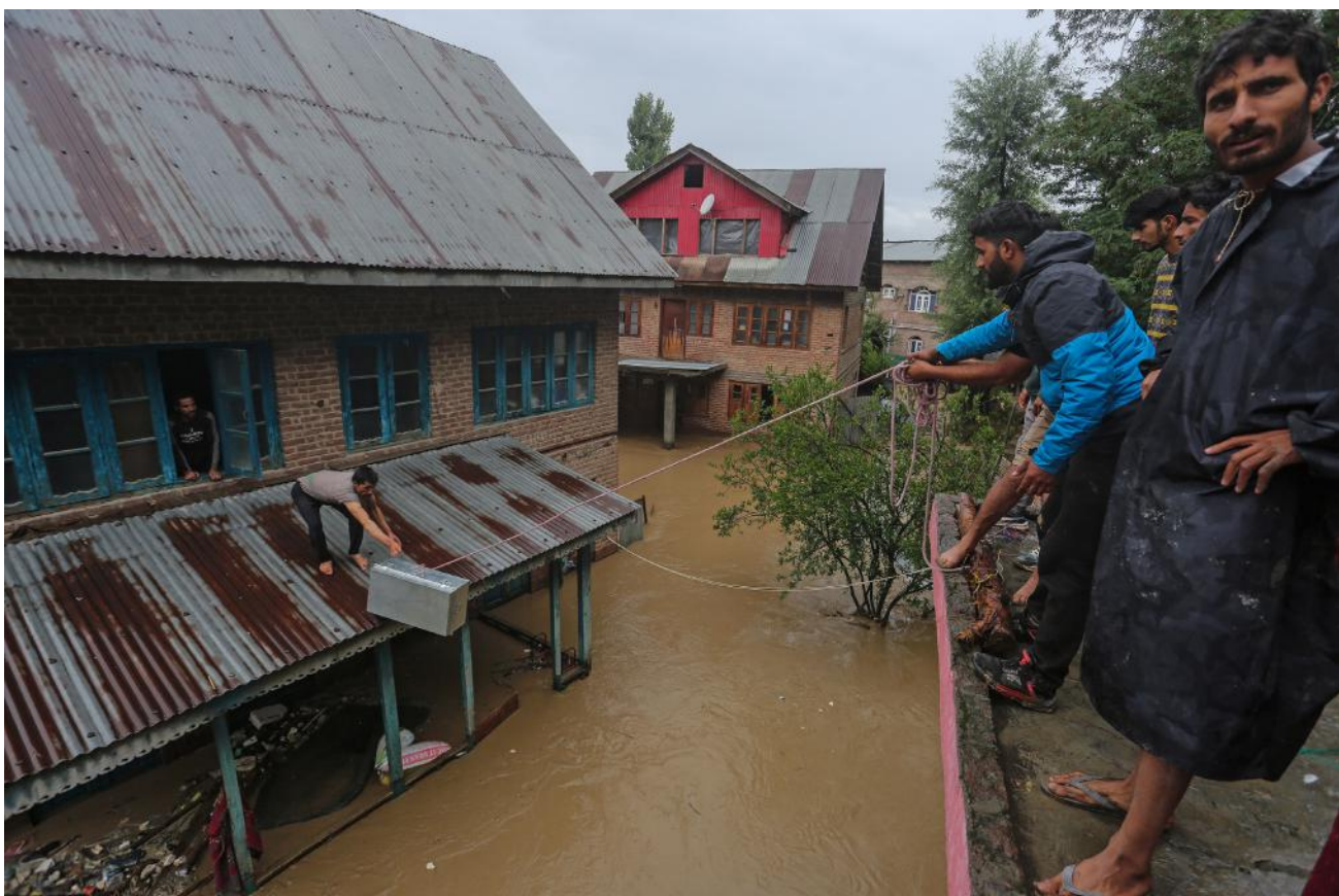
Neighbours help a man retrieve his belongings from a submerged house in Bemina area of the city on Wednesday.