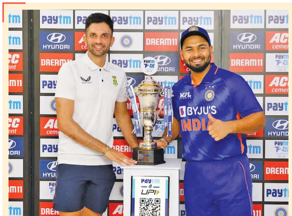
KESHAV MAHARAJ AND RISHABH PANT pose with the trophy after the T20 series ended in 2-2 draw. The last game in Bengaluru on Sunday was called off due to rain with only 3.3 overs of play possible.

"I came here for the gold but had to be satisfied with bronze. I just repeated my last year performance, which was not enough for gold, to change the colour of medal.