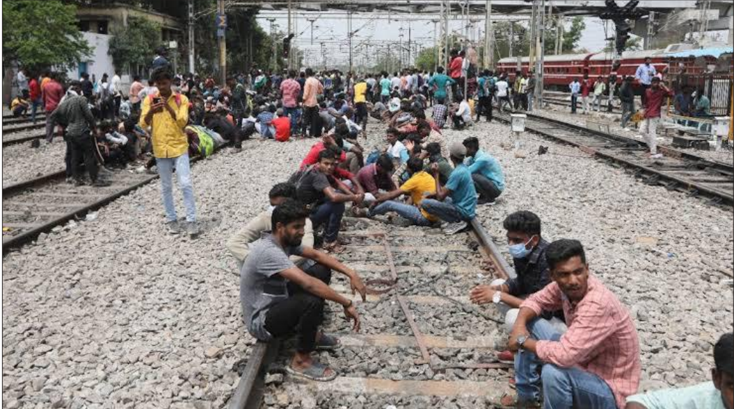
Several Indian Army aspirants took to streets to criticised the scheme.

The Government of India claims that this scheme will create a much more youthful and technically adept war fighting force by ensuring a fine balance between youthful and experienced personnel in the armed forces. Out of the total recruited Agniveers, only 25% will be allowed to continue for another 15 years under permanent commission. While this would reduce the total manpower in the permanent force levels, it will also bring down the expenditure on salaries and pension to a great level. The Defence Minister