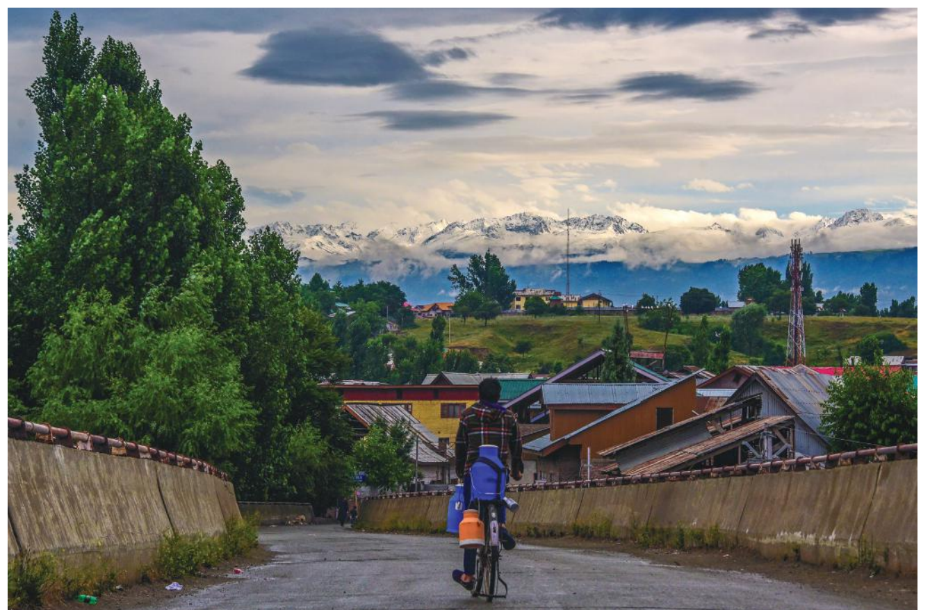
A milkman rides his bicycle in the backdrop of snow-capped mountains of the Pir Panjal range that received rare snowfall on Saturday.

The officials said all arrangements including security made by the Jammu,