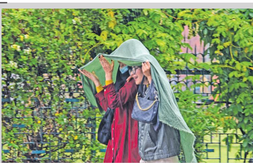
TWO COLLEGE GIRLS COVER their heads with a shawl amid heavy rainfall in Srinagar on Saturday.

Moreover, Div Com directed engineering departments to ensure provision of water and power supply besides completion of construction of access roads at TRTs, simultaneously,