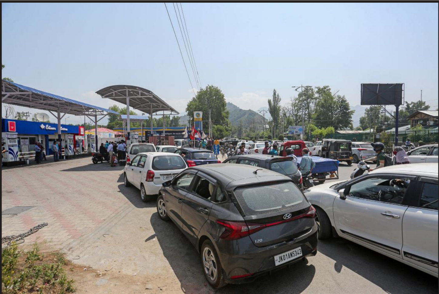
Fuel Stations witnessed massive queues as people scrambled to fill up the tanks in wake of rumors about the shortage of fuel.

After this certification, the hospital shall receive an additional annual grant of Rs six lakh for next three years under National Health Mission, following which there will be re-inspection.