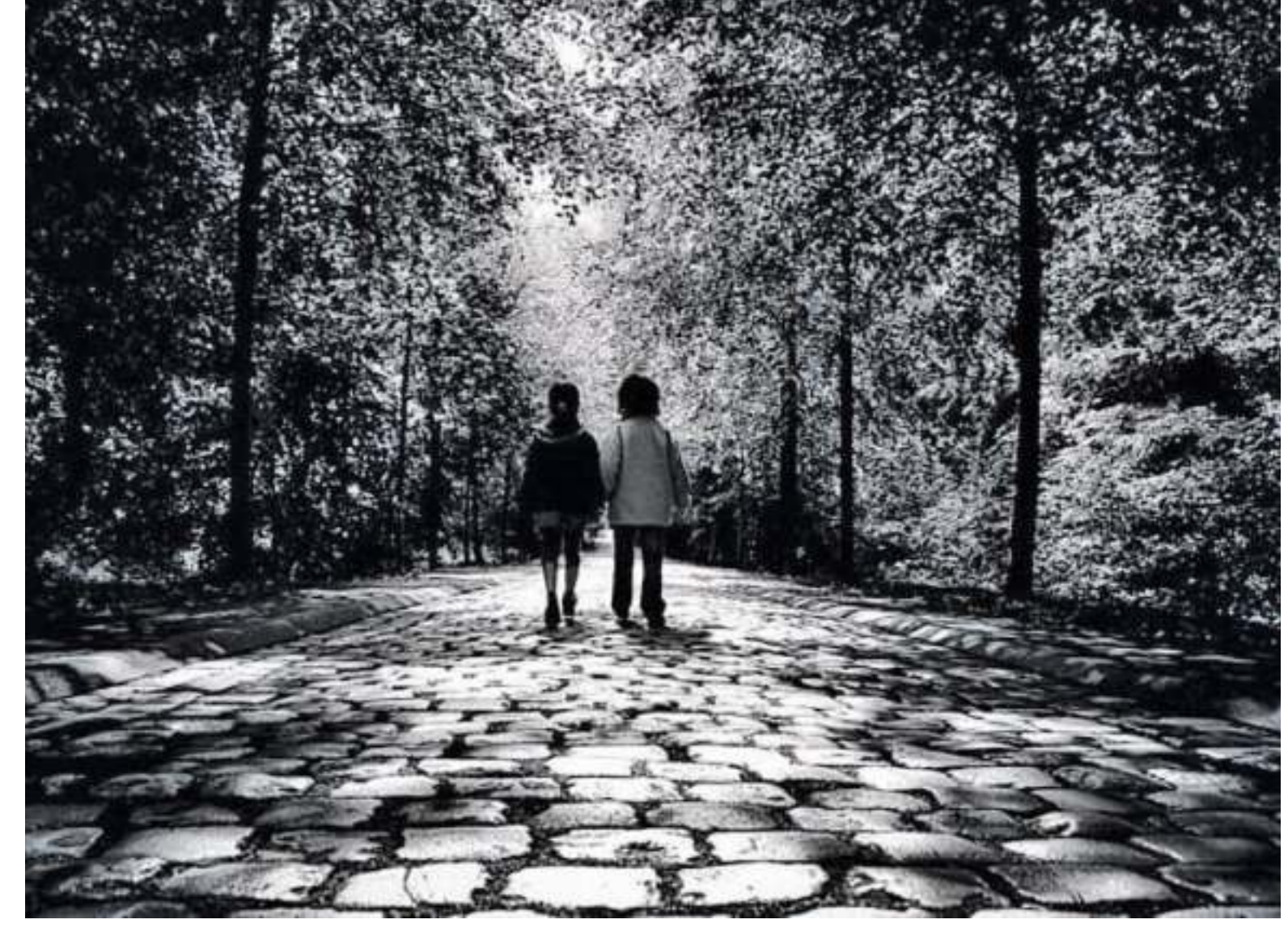
Choose a simple hiking trail that is suitable for the entire family

cause adrenal hyperstimulation and eventually tiredness, by spending some time in nature, parents and children can lower cortisol levels, reduce stress, and improve general health.