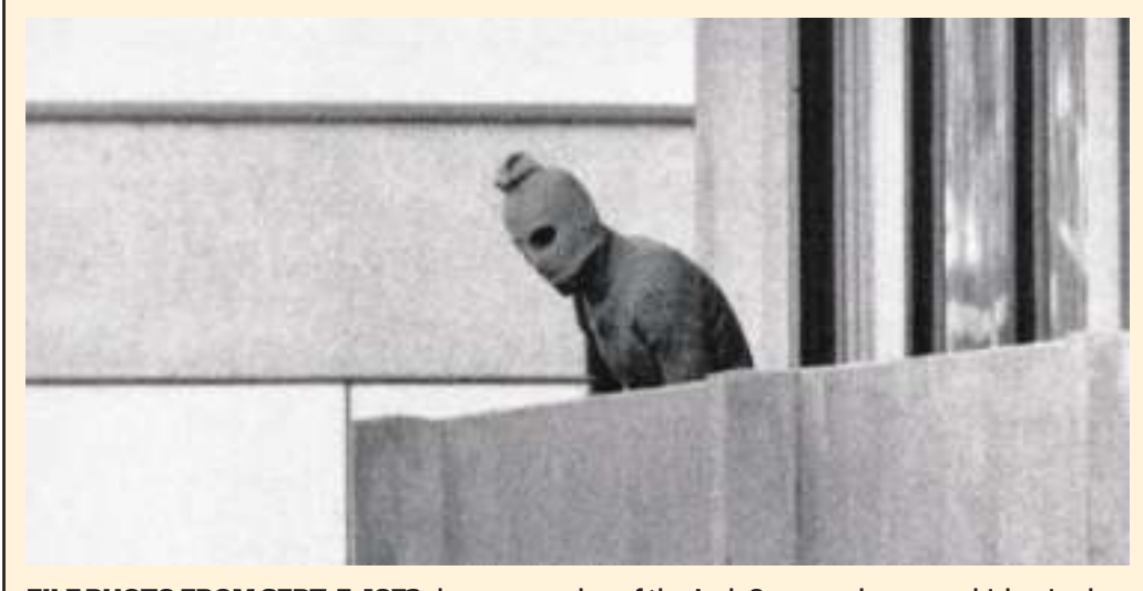
FILE PHOTO FROM SEPT. 5, 1972 shows a member of the Arab Commando group which seized members of the Israeli Olympic Team at their quarters at the Munich Olympic Village appearing with a hood over his face on the balcony of the village building where the commandos held several members of the Israeli team hostage.