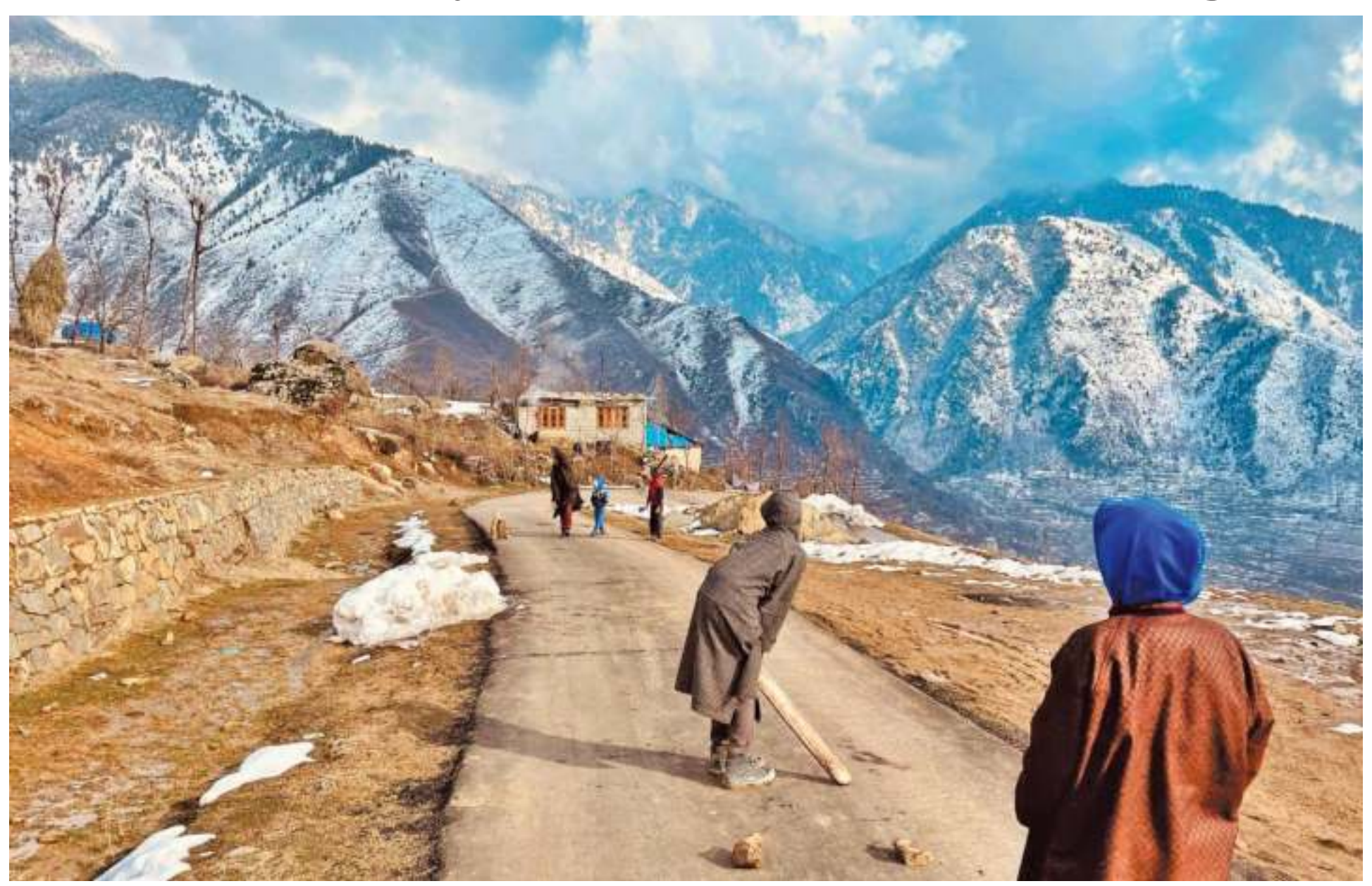
Allow everyone to pick their favourite outdoor activity, then plan each one

Try these simple activities to develop the habit of spending more time in nature: