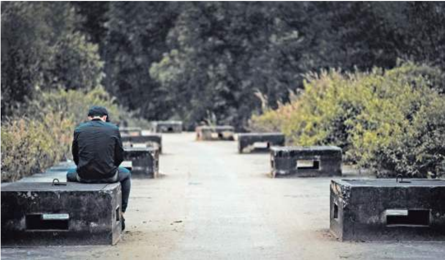
Arendt spent much of her life studying the relationship between the individual and the polis. For her, freedom was tethered to both the private sphere - the vita contemplativa - and the public, political sphere - the vita activa . She understood that freedom entailed more than the human capacity to act spontaneously and creatively in public

In 1961, The New Yorker commissioned Arendt to cover the trial of Adolf Eichmann, a Nazi SS officer who helped to orchestrate the Holocaust. How could anyone, she wanted to know, perpetrate such evil? Surely only a wicked sociopath could participate in the Shoah. But Arendt was surprised by Eichmann's lack of imagination, his consummate conventionality. She argued that while Eichmann's actions were evil, Eichmann himself - the person - 'was quite ordinary, common-