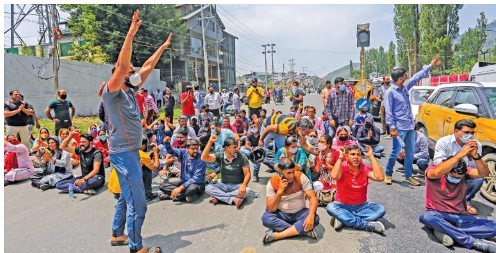
KASHMIRI PANDIT EMPLOYEES staged a protest in Sonawar area of Srinagar on Tuesday against the killing of a schoolteacher in Kulgam.