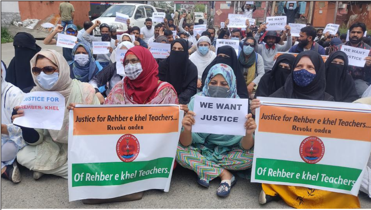
Rehbar-e Khel teachers on Saturday held a protest demonstration at Press Colony demanding regularization and urged the government to revoke the decision to re-advertise the posts they were engaged in.