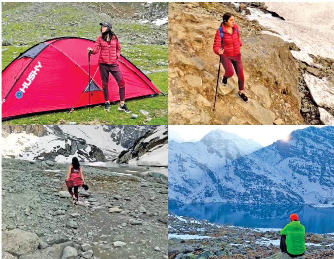
KO Web Desk

Actress Sara Ali Khan has become valley's favorite as she's seen frequenting the valley very often. Her humble and warm demeanor gives away her respectful and responsible behavior towards Kashmir's natural treasures. Recently, she shared some clicks of her trekking adventures here and posed with a few locals who were her trekking pals on the vacay. So, who are these trekkers who take it upon themselves to show the world the many beautiful spots that Kashmir preserves in its womb?