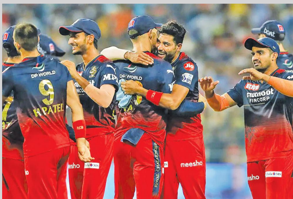
ROYAL CHALLENGERS BANGALORE celebrate after winning their Indian Premier League 2022 Eliminator match against Lucknow Super Giants at Eden Gardens in Kolkata on Wednesday. RCB won the match by 14 runs.