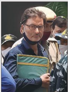
He has been kept in a separate | More on P10