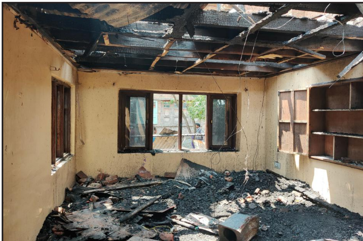
Five residential Structures were damaged in the incident.