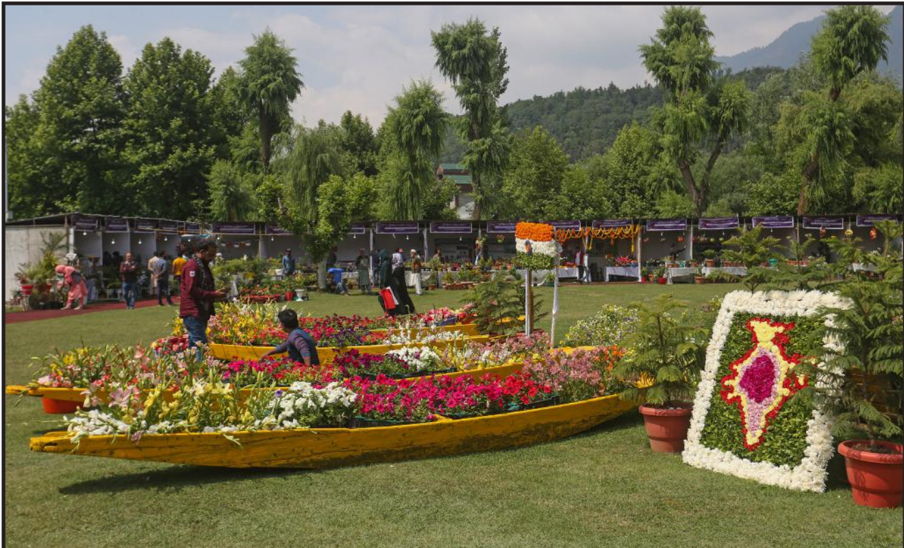
A Two Day Flower show was organized by the Department of Floriculture at the Botanical Garden to provide a platform for flower growers to showcase their flowers.