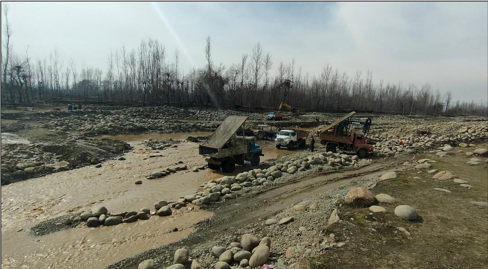
In Picture: Shali Ganga after mining.