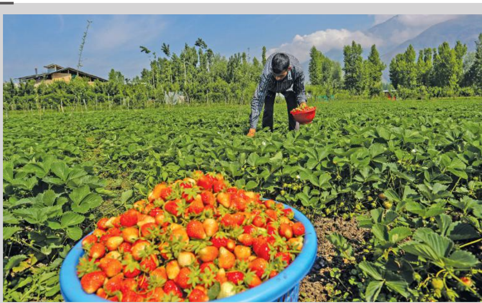
captures a villager picking up strawberries from his field in Srinagar outskirts on Monday.

A total of 62 ATM cards of different banks, Rs 10,000, a sharp-edged weapon (Khukri) and a vehicle were seized from those arrested, the spokesman said, adding a case under relevant sections of the Indian Penal Code and Arms Act was registered against the six and further investigation is on.