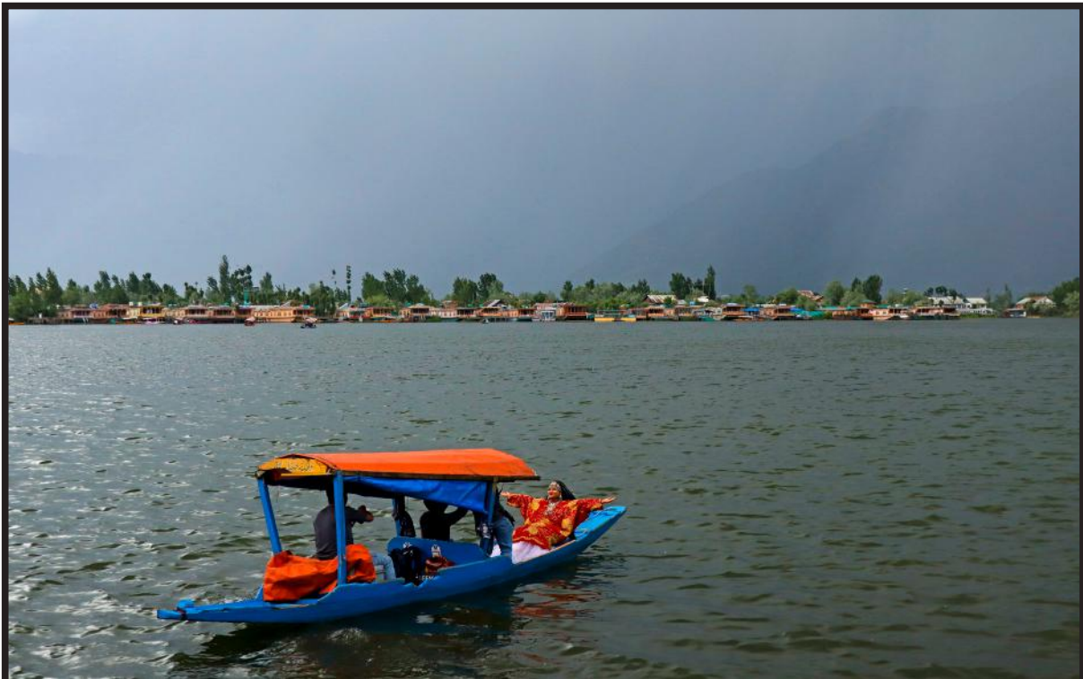
A tourist dressed in traditional Kashmiri attire poses for a picture in Dal Lake on Friday.