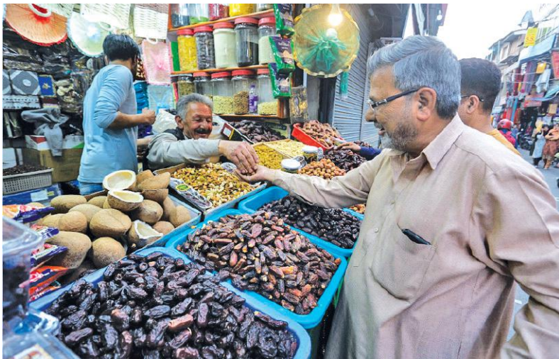
A Dry fruit seller hands over a fistful of dry fruit to a costumer over a counter full of dates meant for Ramazan.