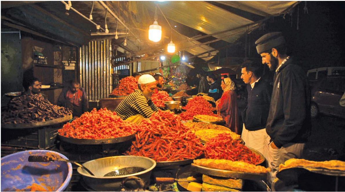
Women and men shop for popular fried street food kiosks in Kashmir during the month of Ramazan.