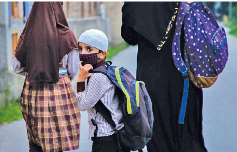
A young boy is headed to his school with his sisters wearing the Muslim prayer cap during Ramazan.