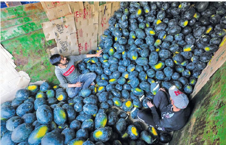
Watermelon sales broke all records this Ramazan in Kashmir. Reportedly, Watermelon worth Rs 5 crores were sold everyday.