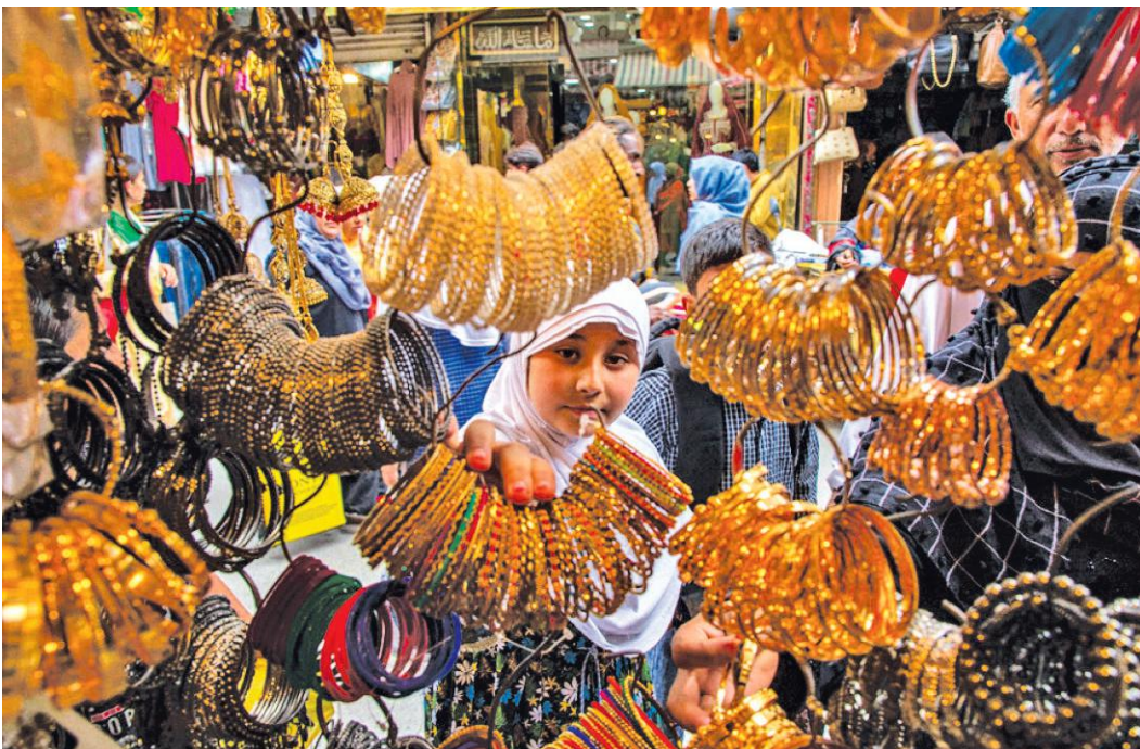
A girl looks at an assembly of Bangles at the eve of Eid.