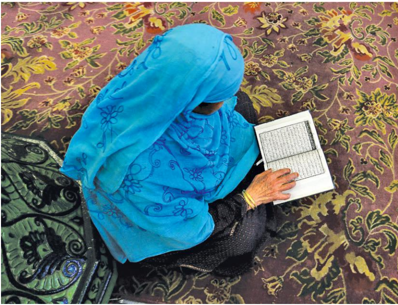
A woman intently reciting Quran, the holy book of Muslims.