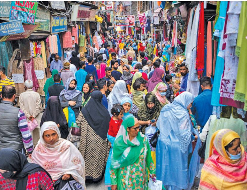
Women shop for clothes in a busy market ahead of Eid.