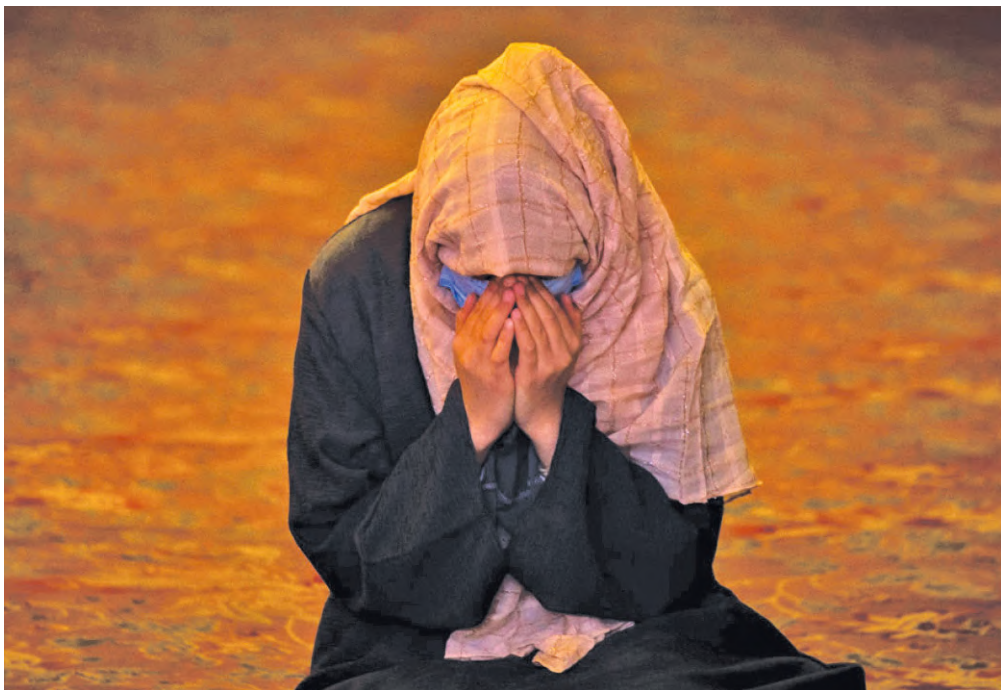
A girl praying inside the shrine of Sheikh Abdul Qadir Jeelani (RA) during Ramazan.

For women, the concept of worship during Ramazan moves beyond worship. Very often, women feel that they're so occupied with daily chores that they do not find to retreat and spend a minute with Allah. But Allah's infinite mercy is wise, He blesses each one for in every role of service to our family. In our society, women's worship moves beyond the boundaries of five prayers or recitation and extends to the unparalleled reward of making Sehri, cooking Iftaar, getting the kids ready for school and in many cases, rushing to their own work places. Kudos to them, today and each day! Here are some clicks out of the cameras of our photographers showing women enjoying their time in prayer, worship and some necessary Eid shopping!