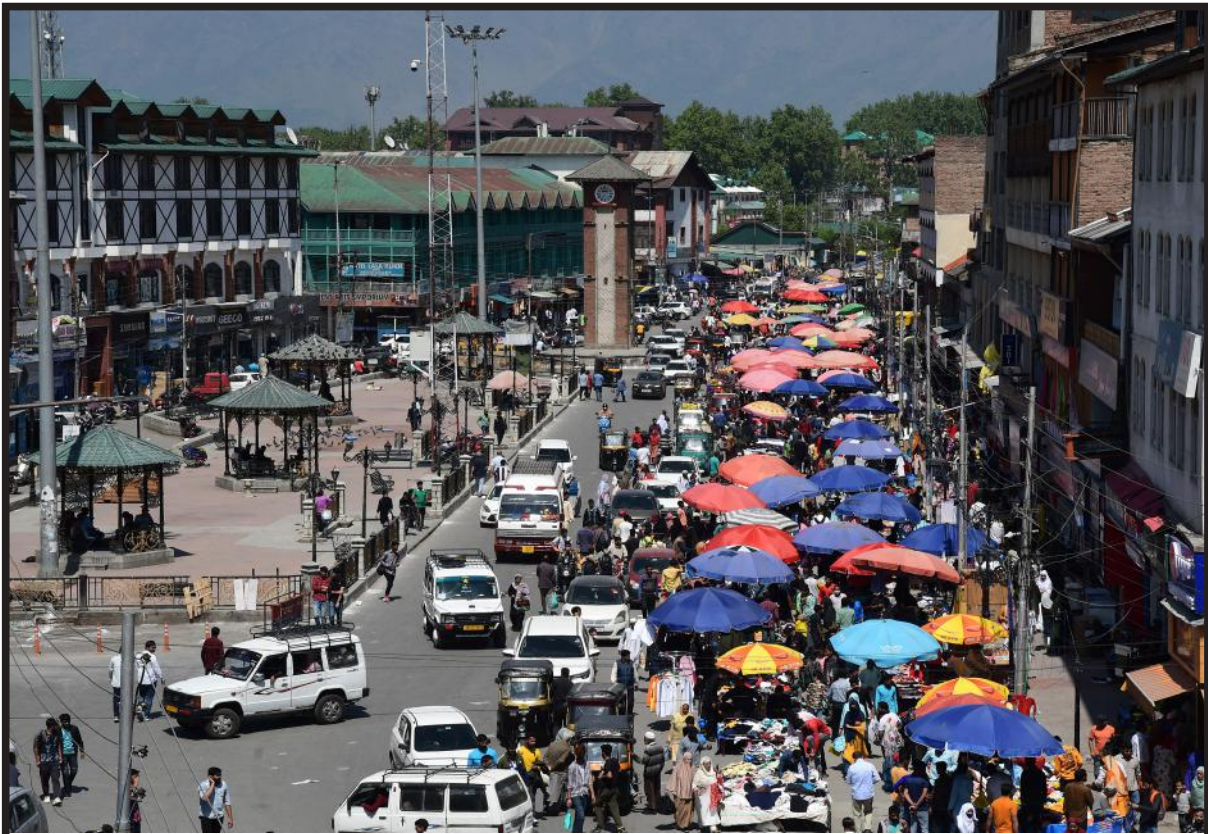
City Centre Lal Chowk witnessed heavy rush of shoppers on the last day of the Holy Month of Ramazan known as the day of Arafa.