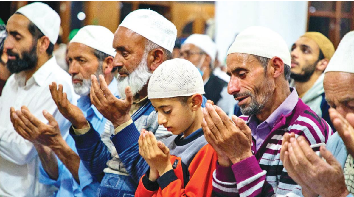
A congregation of worshipers raise hand in prayers in a mosque in Kashmir