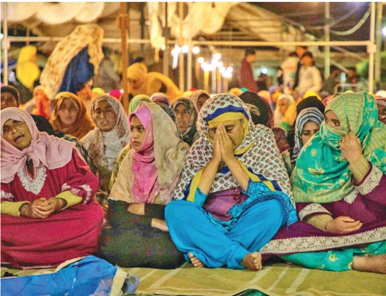
Women congregation prays during the night of Laylatul Qadr during Ramazan