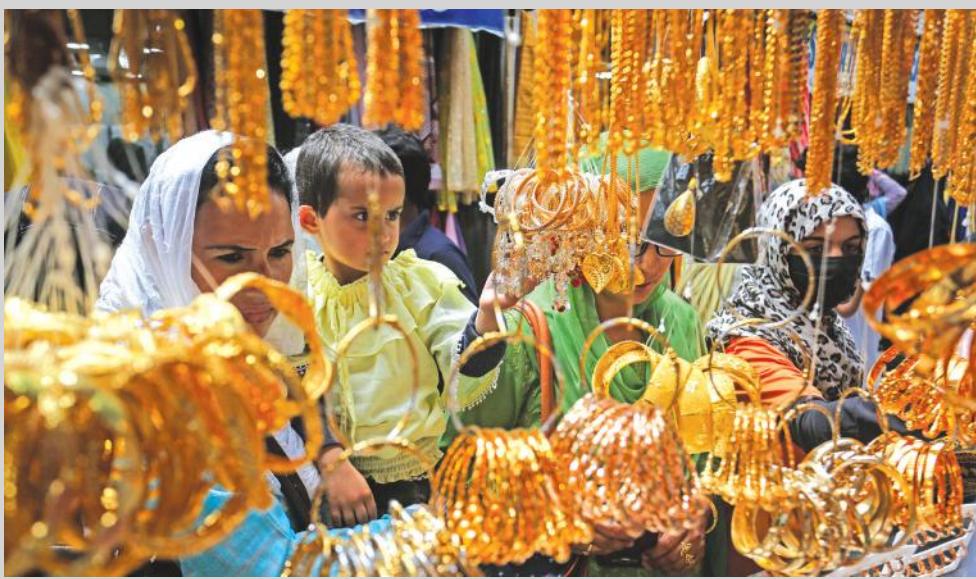
A GIRL FIXES HER GAZE at an artificial necklace in the busy marketplace of Gonikhan in Srinagar, which witnessed a huge rush of shoppers ahead of Eid-ul-Fitr.