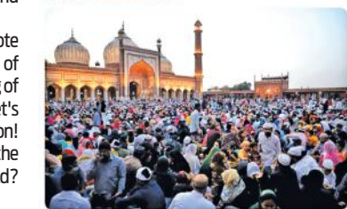
Praying during the holy night of Lailat al-Qadr for the safety and well-being of our Muslim brothers and sisters in India. Let's spread awareness to this shameful situation! What is happening to the human rights in the so-called largest democracy in the world? #BreakTheSilence