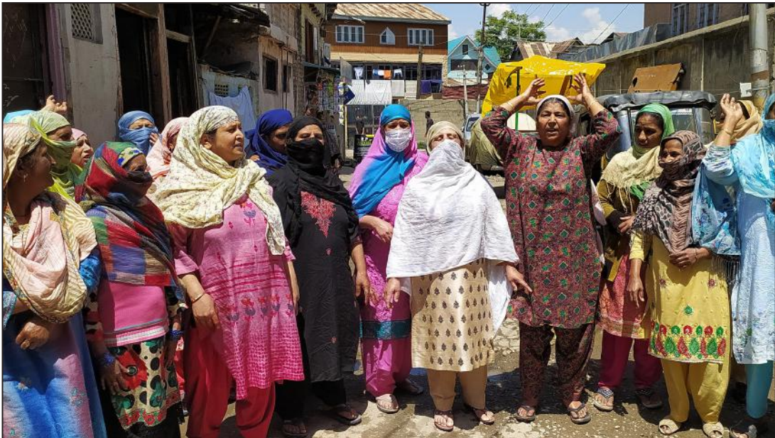
Women took to the streets in Haft Chinar area of the city on Tuesday to protest electricity shortages and installation of smart meters by the PDD.

It was stated that the beautification plan will be taken on a broader scale in which all the Government structures including offices, buildings, residential places, complexes and private properties including residential houses, markets and other vital places will undergo facade uplifting, painting of rooftops and uplifting of shops and main markets in the City.