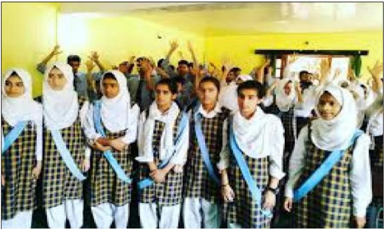
Group of normal and deaf & mute children studying together