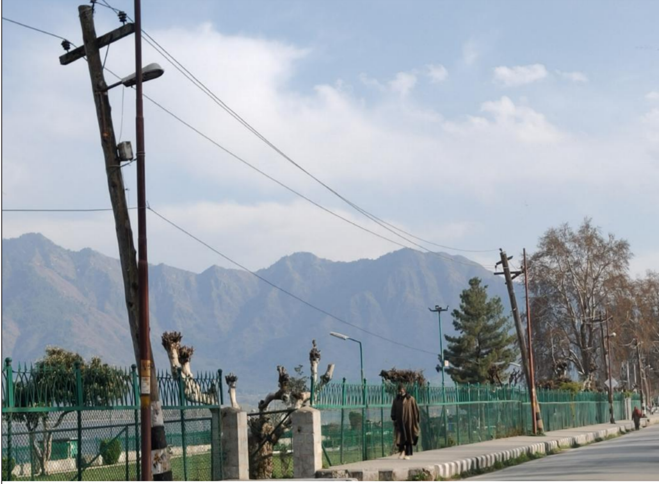
POLES APART: Despite erecting new electric poles, the old poles are still standing their ground in Hazratbal, Srinagar.

A large number of people actively participated in the Gram Sabhas, during which agenda points along with other issues were discussed in detail and focus was laid on the developmental activities of respective Panchayati Halqa.