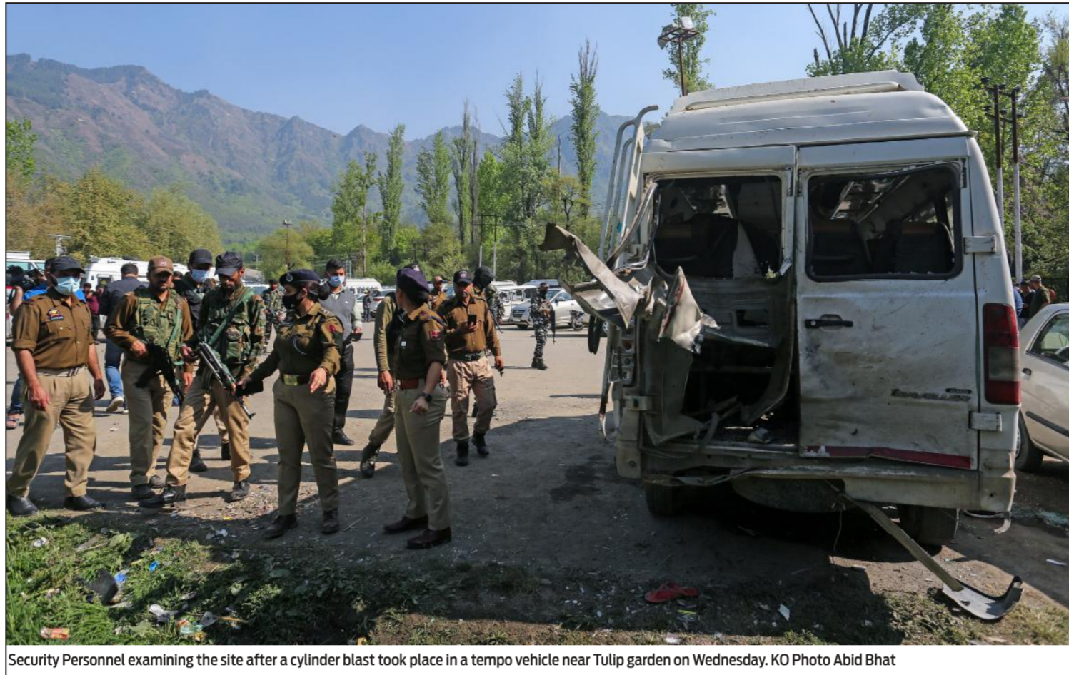
Security Personnel examining the site after a cylinder blast took place in a tempo vehicle near Tulip garden on Wednesday

An official said that frisking operations have been intensified in Srinagar in the wake of militant presence.