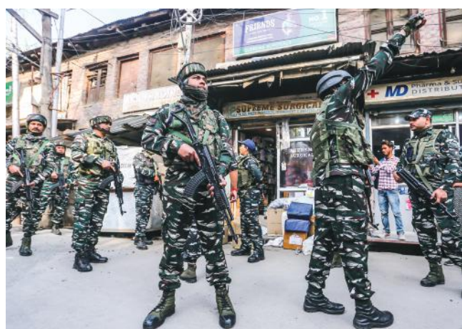
CRPF personnel keeping tight vigil in Maisuma on Monday after a militant attack left a head constable dead and another personnel injured.

Soon after the incident, a contingent of police and CRPF personnel reached the spot and carried out a search operation to nab the attackers. The