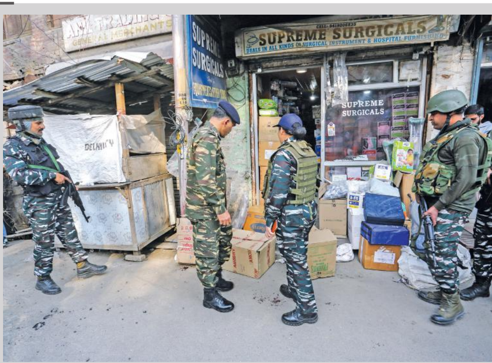
SENIOR CRPF OFFICERS inspecting a shootout site in Srinagar's Maisuma on Monday after militants shot dead a head constable and injured another.

"The Community Health Centre Level Environment Cell shall facilitate preparation and proper implementation of State Action Plan for Climate Change and Human Health," the order reads.