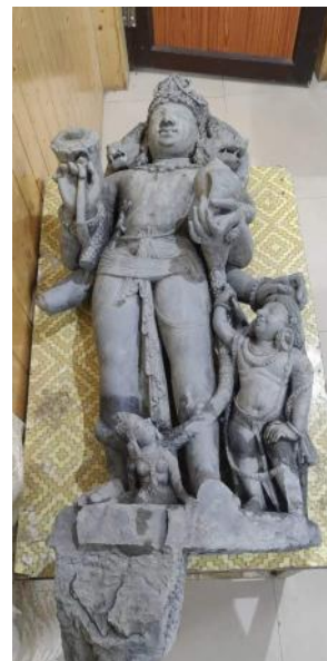
in SPS Museum Srinagar for further studies.

The finely carved and well dressed/polished sculpture demonstrates clearly the sculptural style in use at Avantipora during the 9th century AD. The sculpture is now housed