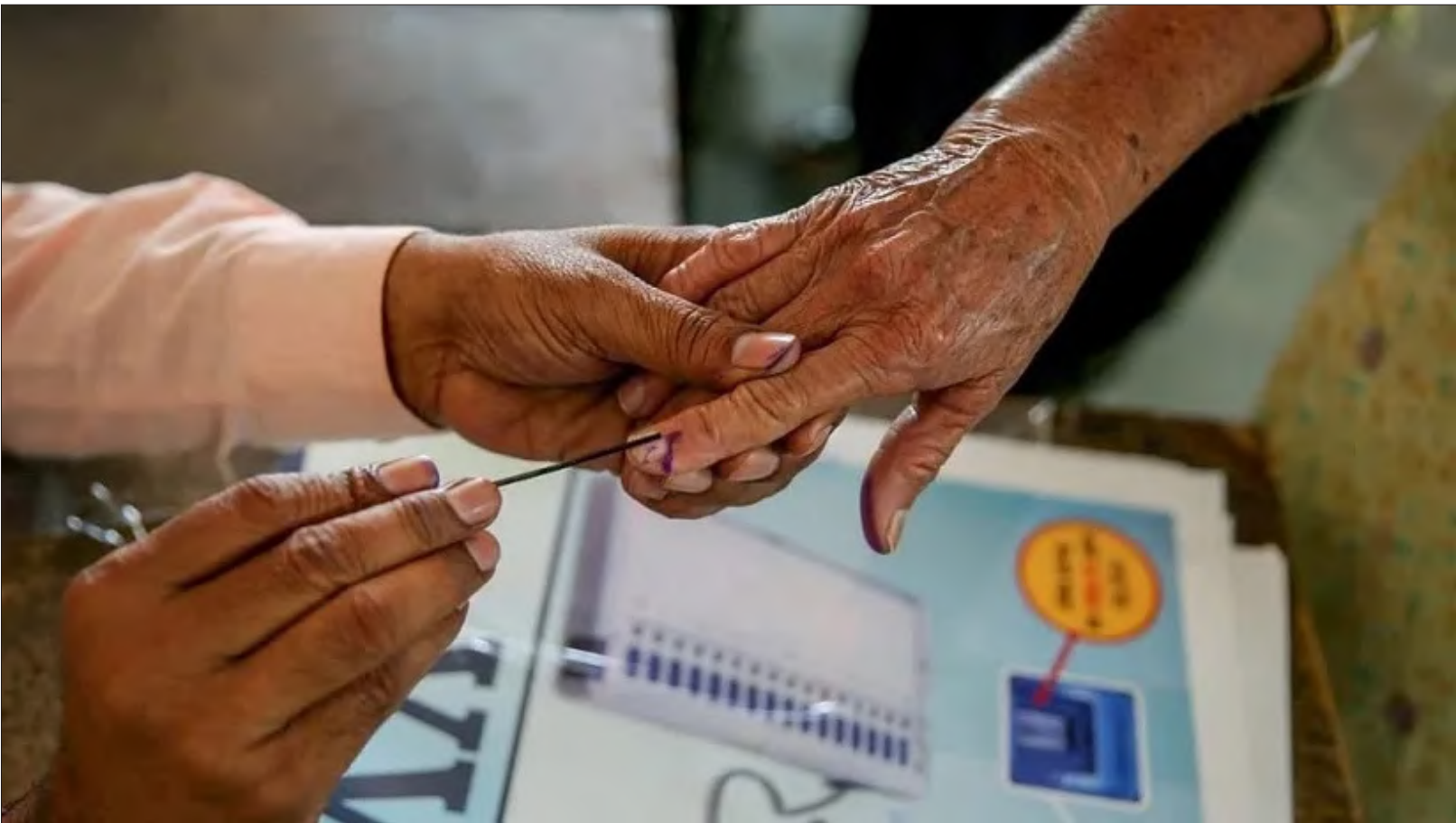
For representational purposes only.