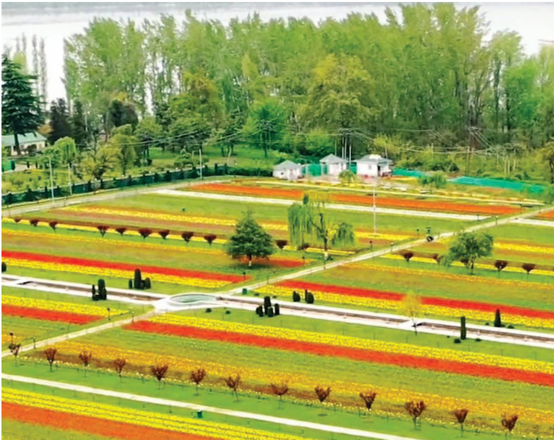
A still from @outdoorshotz's video