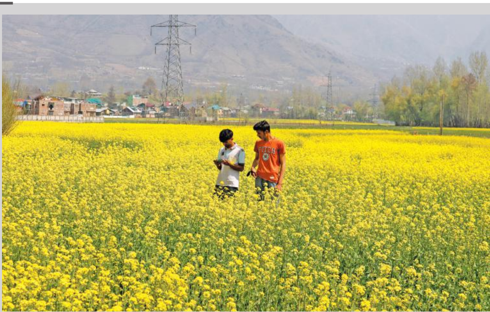
TWO BOYS WALK THROUGH a mustard field on a warm sunny day in the Srinagar outskirts on Thursday.

The Advisor said that it is the firm resolve of our Prime Minister, Narendra Modi and Lieutenant Governor, Manoj Sinha to make J&K one of the most developed regions of our country.