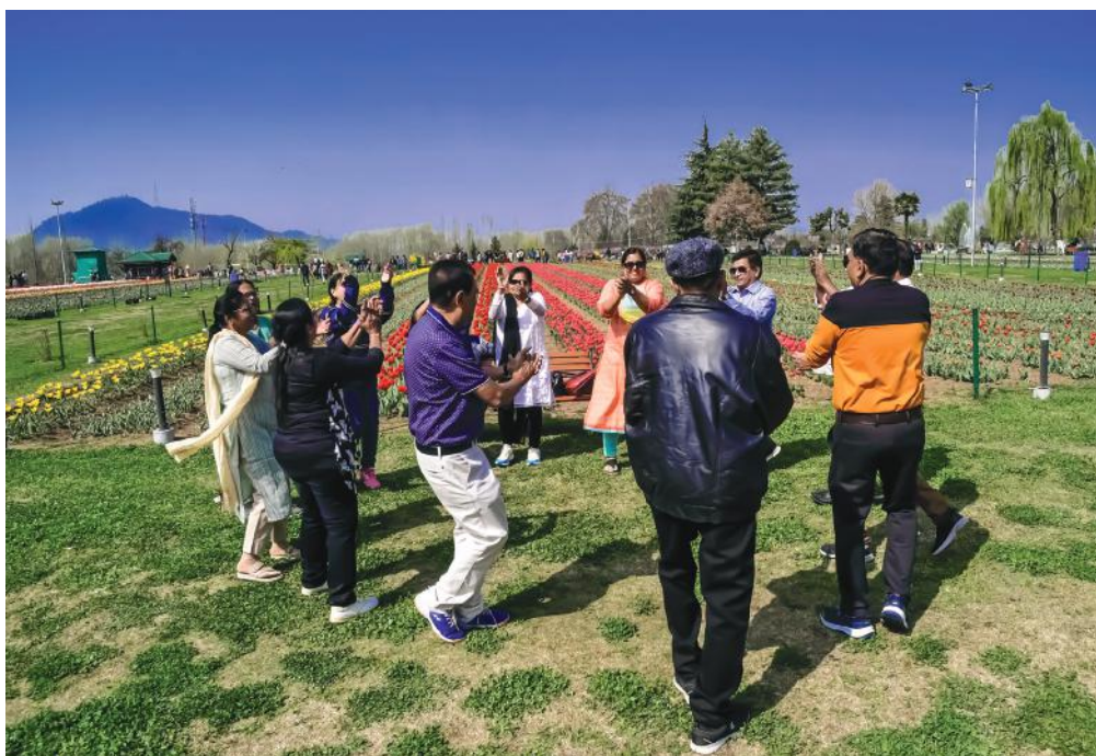
Tourists dancing in excitement at seeing the tulips in full bloom at Srinagar Tulip Garden which was thrown open for the public on Wednesday.