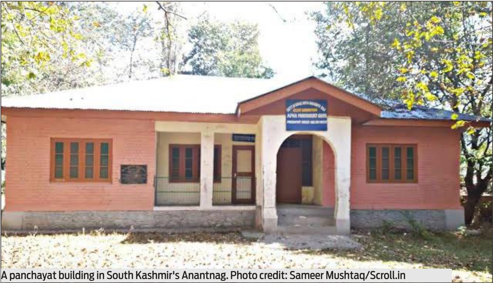
A panchayat building in South Kashmir's Anantnag.

A people's movement or an aware citizenry is necessary for realizing the full potential of the local state