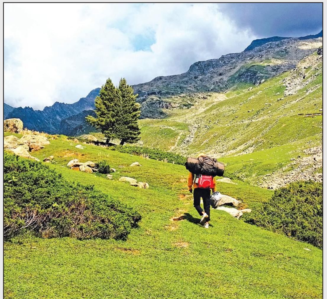
A trekker on the way to Harmukh mountain in Bandipora district.