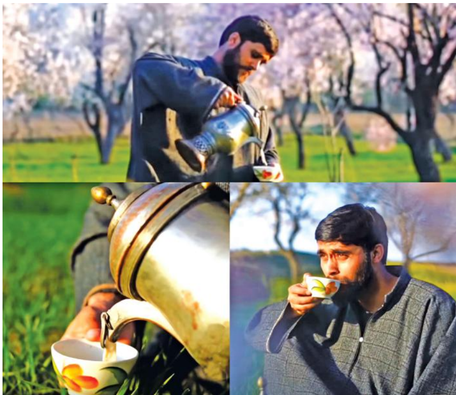
Stills from Iqbal Farooz's (Wandering_Lenses_) latest reel