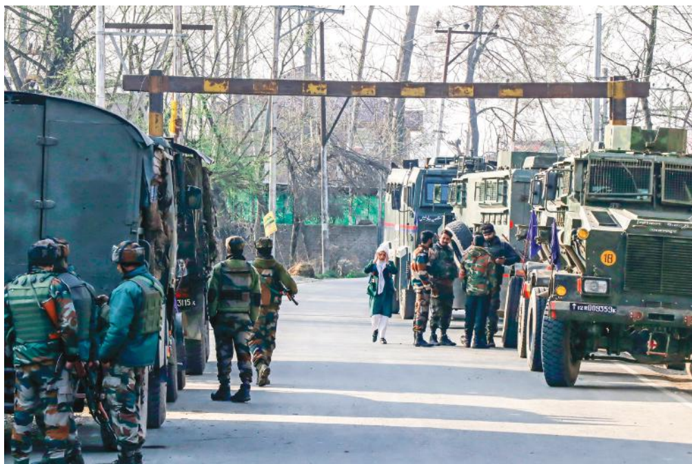
A girl student walks past security men and their armoured vehicles during an encounter in the Nowgam area of the city on Wednesday.