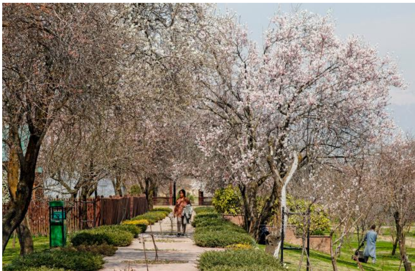
Situated on the foothills of Kohi-Maran, Badamwari or the almond alcove is drawing huge crowds as the almond trees have started blooming with the onset of spring season.

Srinagar: A youth was found dead on Monday in River Jhelum in Bijbehara area of south Kashmir's Anantnag district. According to reports, the villagers of Zirpara in Bijbehara spotted a body inside Jhelum River on Monday morning and instantly informed the police about it. A police team reached the spot and took More on P6