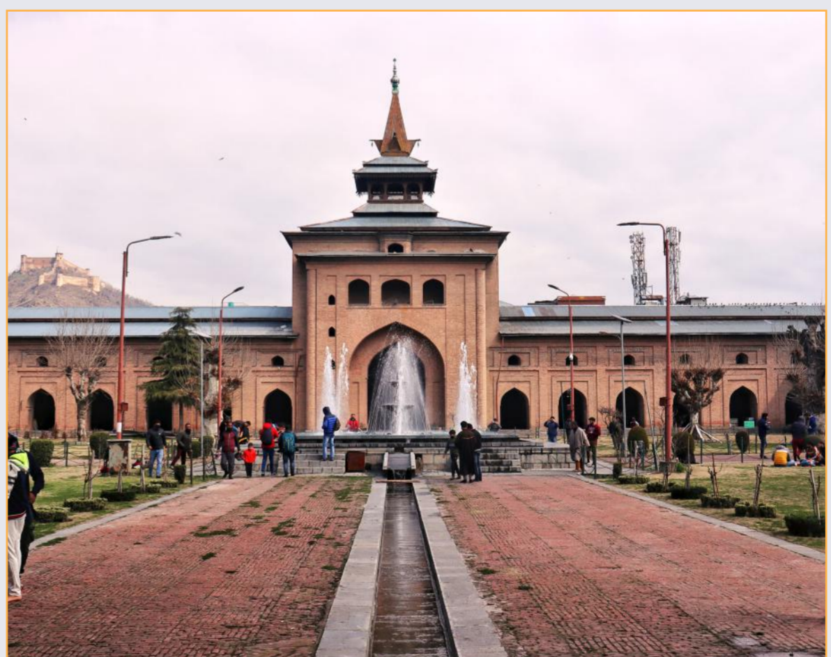
A MESMERIZING VIEW OF KASHMIR'S LARGEST MOSQUE Jamia masjid situated in the old city at Nowhatta.