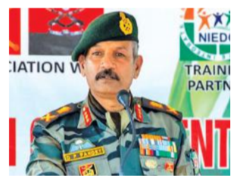
Western Army Commander Reviews Operational Preparedness