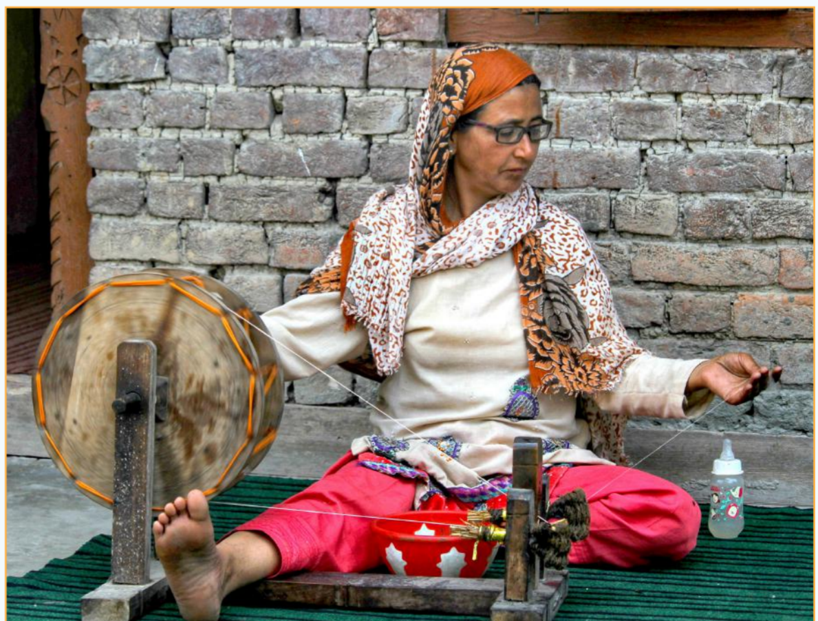
IN THE INTERIORS OF DAL LAKE, A KASHMIRI woman spins yarn on a traditional wheel.

Want your pictures to get featured? Send them to us on editpage.ko@gmail.com