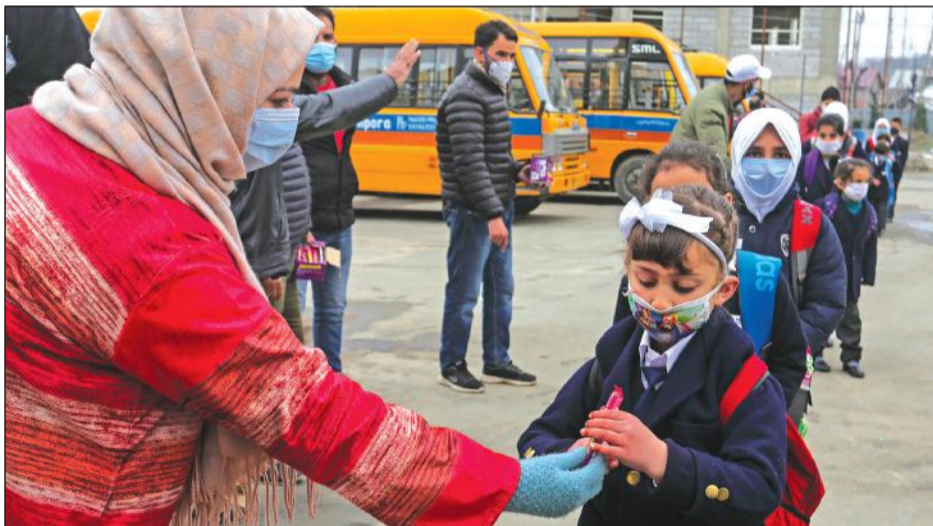
A TEACHER OFFERS CANDIES TO A GIRL STUDENT on the reopening of schools in Srinagar and other parts of the Valley on Wednesday after a 31-month break.