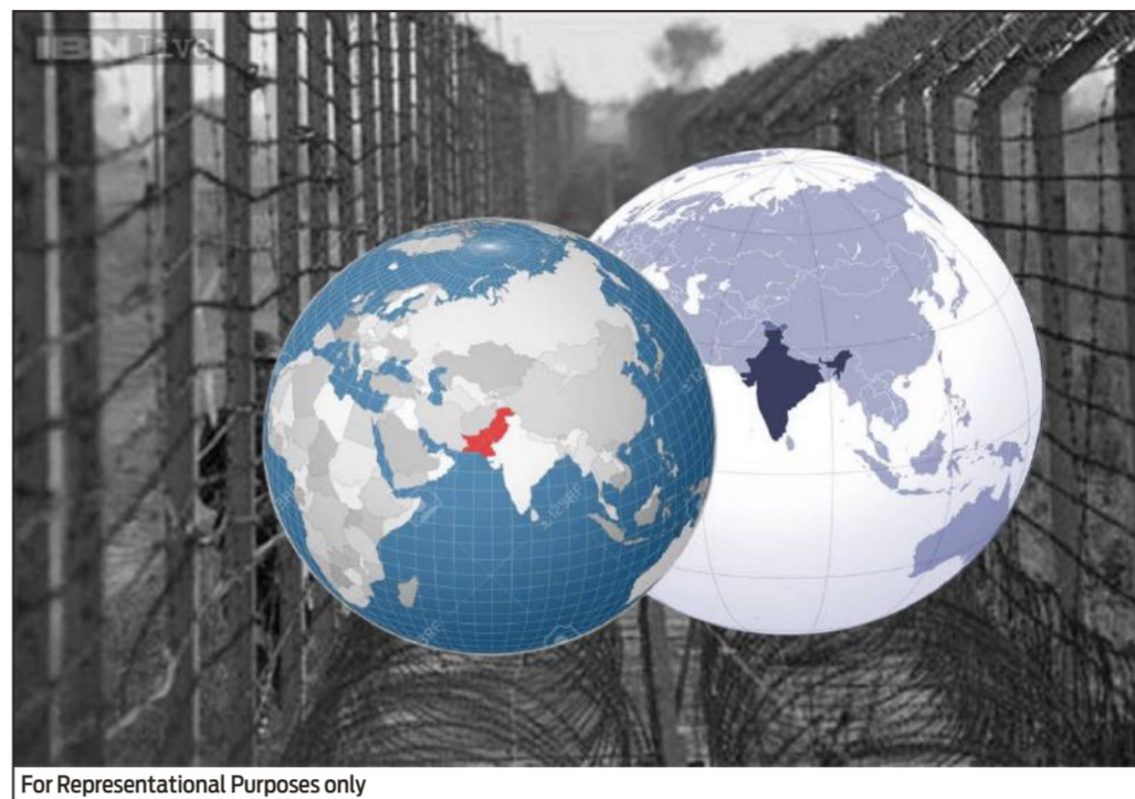
For Representational Purposes only

The LoC agreement is also traced to the US nudging the two countries from behind the scenes. The US involvement in the relationship between India and Pakistan is a fairly complex affair. New Delhi wants the US to intervene to sort out the terror problem in Pakistan, but it brooks no meddling in Kashmir. Similarly, Is-