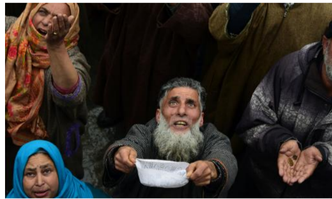
An elderly man holds his skull caps in supplication as the head cleric (not in the picture) displays a relic believed to be from the beard of Prophet Muhammad (PBUH) at the Hazratbal Shrine on Me'raj-e-Alam on Tuesday.

Notably, Muslims every year celebrate on 27th of Rajab (Hijri calendar), the Isra and Me'raj, the two parts of a Night