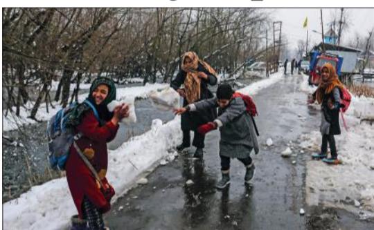
Children throw snowballs at each other in the interiors of Dal Lake on Thursday.

all flights were delayed while at least two flights were cancelled.