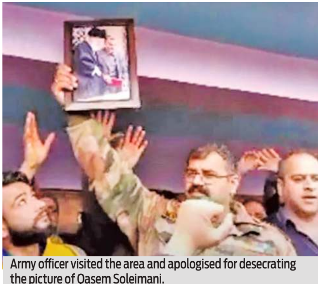
Army officer visited the area and apologised for desecrating the picture of Qasem Soleimani.

"The Army soldiers desecrated our martyr Soleimani during