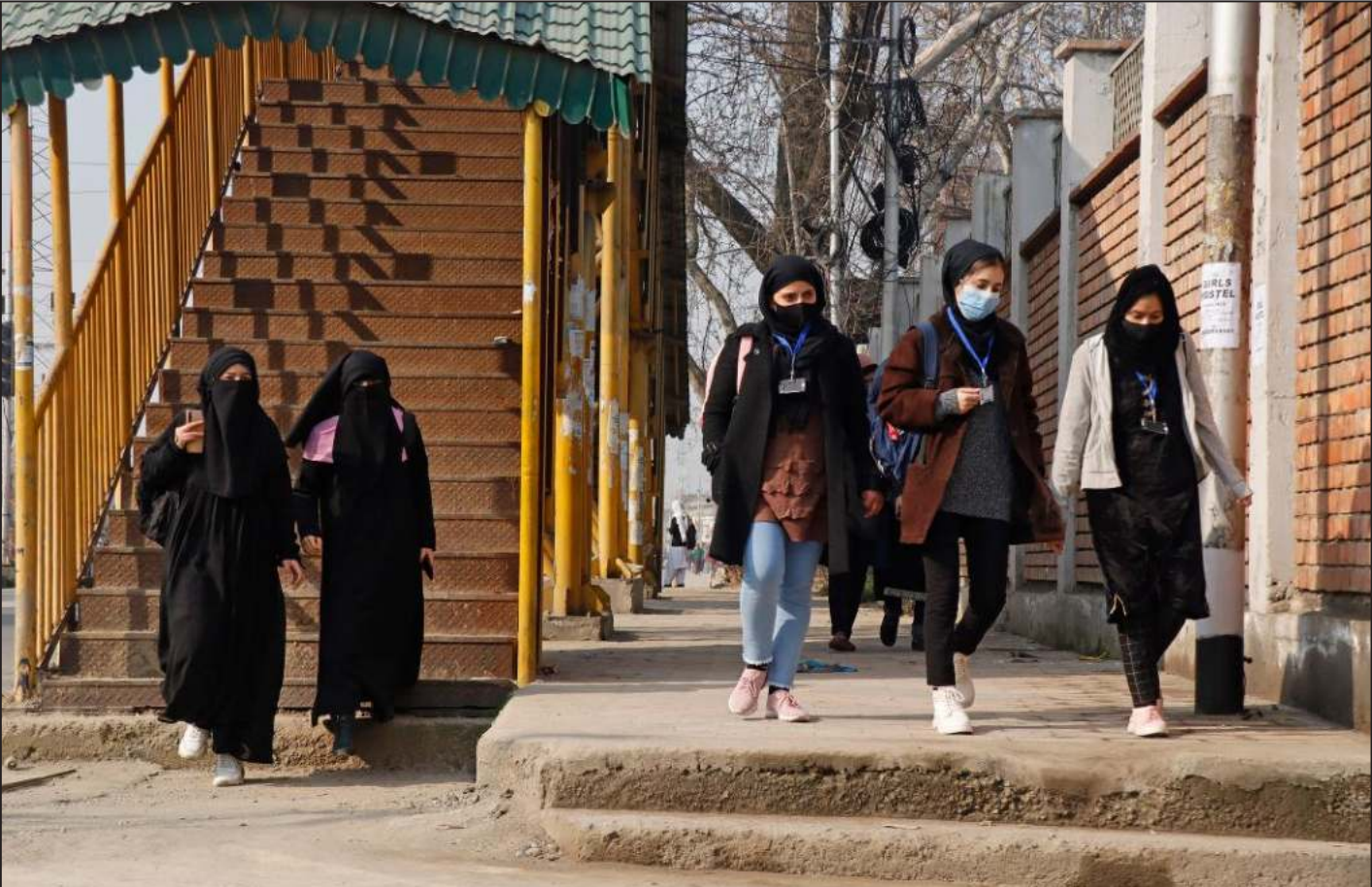
Amid dip in Covid-19 cases, colleges reopened in Srinagar on Tuesday. Students dressed in uniforms and carrying vaccination certificates were seen thronging their institutions in Srinagar.

He said that sanitizers have been kept at several places to ensure hand hygiene by both faculty members and students.