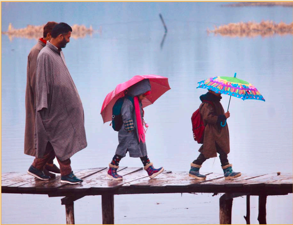
KIDS GOING FOR TUTIONS on a chilly winter morning on a wooden bridge in the interiors of Dal Lake Srinagar.

Want to get your photos featured? Send them to us at editpage.ko@gmail.com