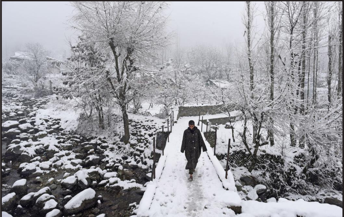
Many parts of Srinagar on Wednesday experienced fresh snowfall while plains received rains, bringing down the temperature further in the Valley. However, a local Meteorological department (MeT) here has predicted erratic weather conditions till February 08.

“Such happenings are increasing unemployment in the Union Territory. The government has not been able to provide employment to locals, rather it is snatching the means of unemployment from the locals, leaving the locals to lurch at large,” she said.