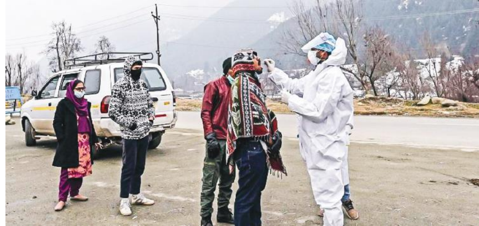
A health worker collects nasal swabs from tourists for Covid-19 testing in the outskirts of Srinagar.