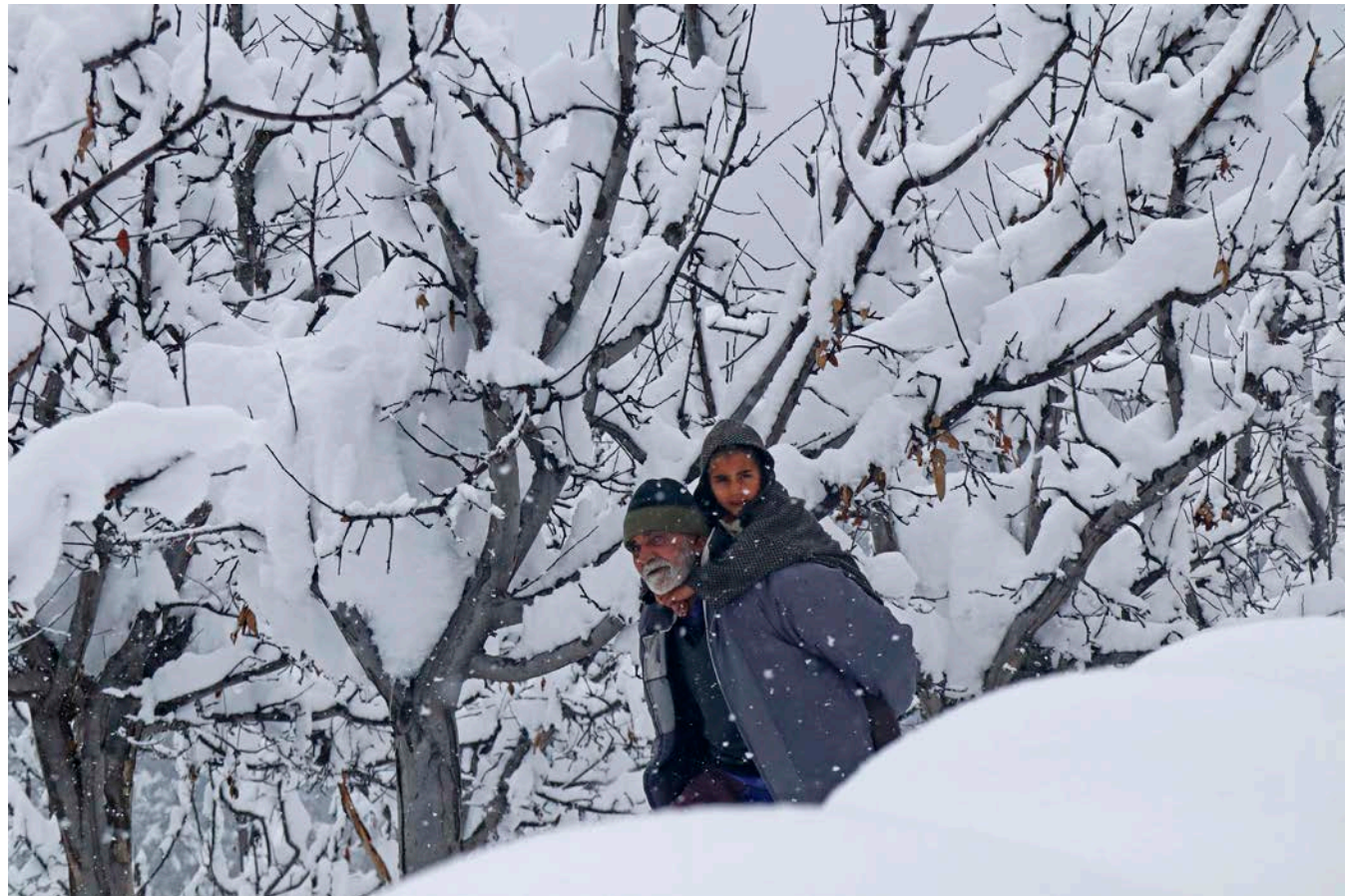
An elderly man carries his grandchild on his shoulders during fresh snowfall in Hirpora area of Shopian district.