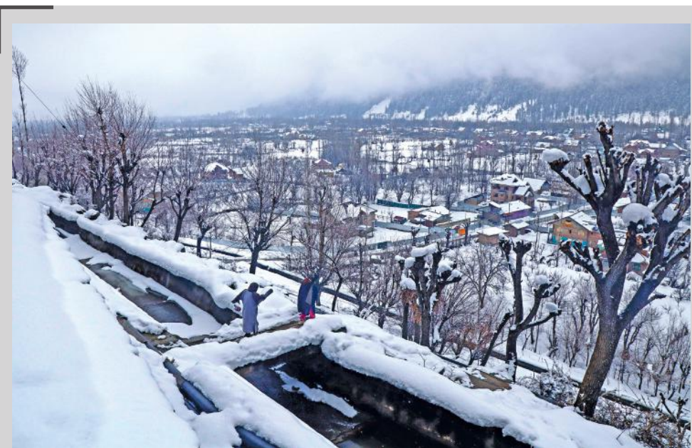
TWO GIRLS CROSS over a bridge in the snow-covered Tangmarg area of Baramulla district on Saturday.

A case has been registered in this regard.