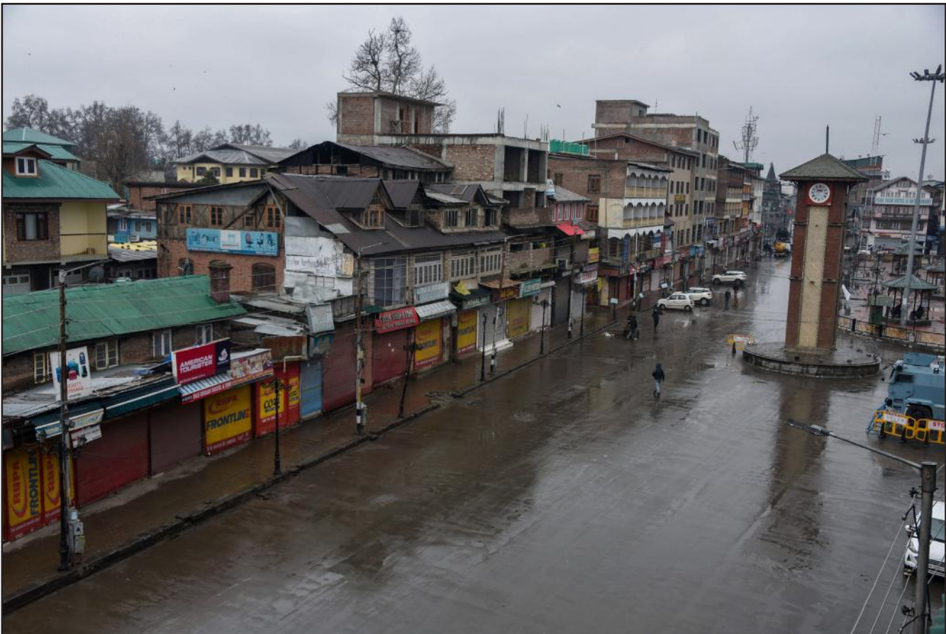
Normal life was affected across Srinagar city as authorities placed restrictions on the non-essential movement of people in view of upsurge in covid-19 cases, officials said.