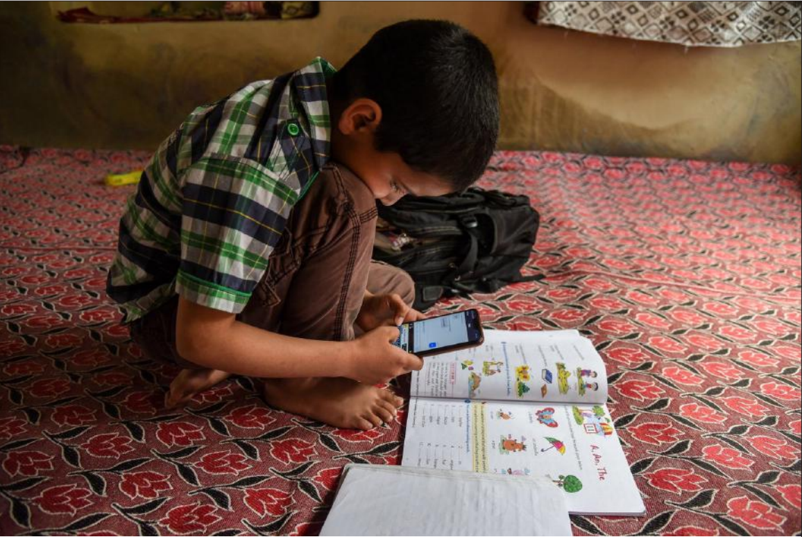
A YOUNG STUDENT IN KASHMIR attempts to learn from home during lockdown.

The article is an editorial from KO Archives and was originally published on 11th October, 2011