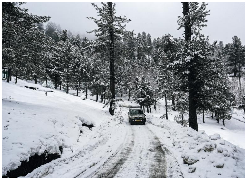
An SUV passes through a snow-covered road in Tangmarg following overnight snowfall on Saturday.

The official further said that the weather More on P10