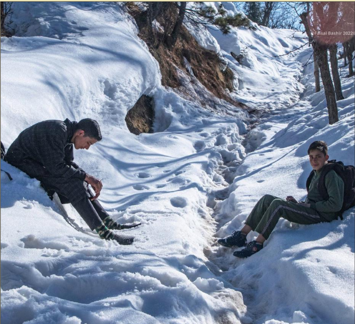
KASHMIRI BOYS WHILE HEADING TOWARDS THEIR HOMES , taking rest on way after coming from tuition classes after heavy snowfall in a hilly area of Budgam district.

Want to get your clicks featured? Send them to editpage.ko@gmail.com