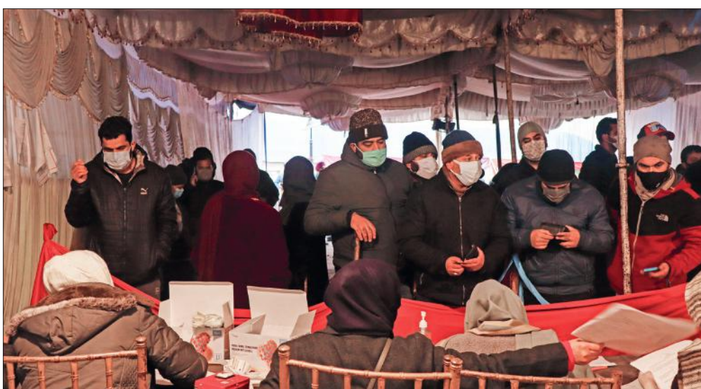
People wait for their reports inside a makeshift Covid-19 testing facility at the Tourist Reception Centre (TRC) Srinagar on Wednesday.